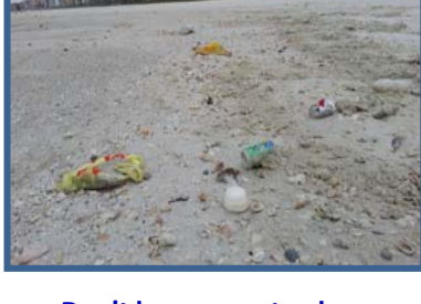
Don't leave your trash on the beach!

1 Month 50 Years 200-500 Years 500-1000 Years 450-1000 Years 550 Years 700 Years 1-2 Million Years 1+ Million Years NEVER