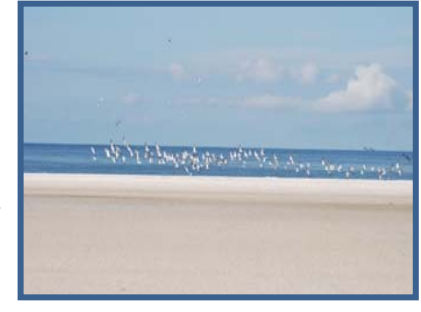
Let's Keep Our Beach Beautiful!

TO PARTICIPATE IN A BEACH CLEAN UP OR BE A VOLUNTEER BEACH STEWARD, PLEASE CONTACT THE CITY OF MARCO ISLAND AT 239-389-5000