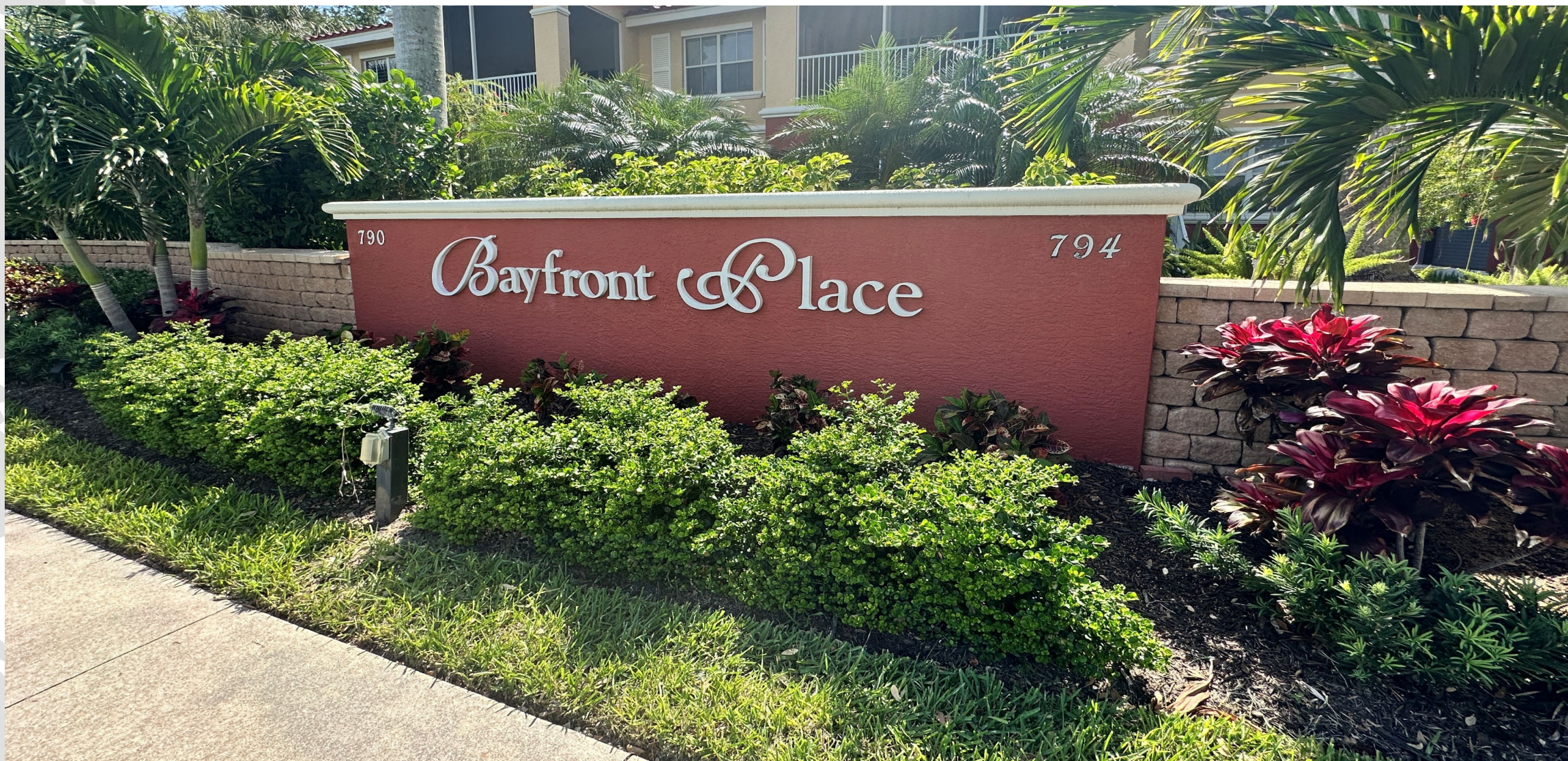
Condominiums Runner-Up ... Bayfront Place