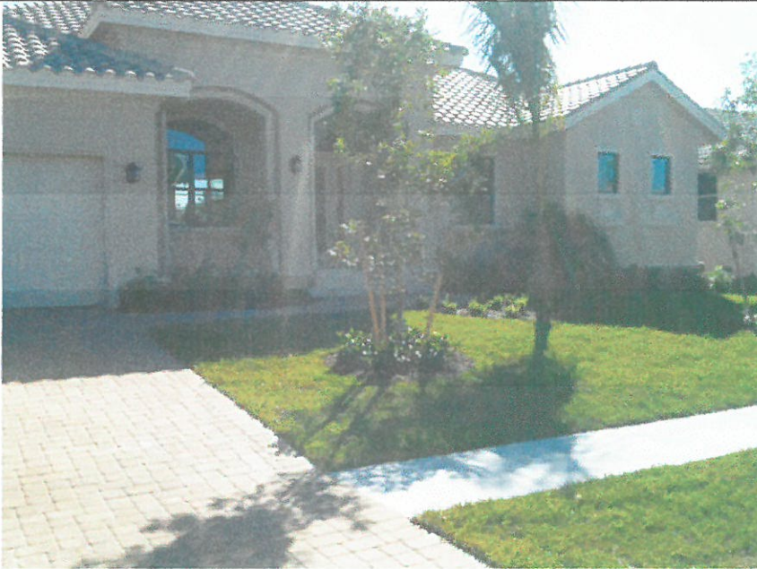
FRONT VIEW 1/16/2014

If using the Elevation Certificate to obtain NFIP flood insurance, affix at least 2 building photographs below according to the instructions for Item A6. Identify all photographs with date taken; "Front View" and "Rear View"; and, if required, "Right Side View" and "Left Side View." When applicable, photographs must show the foundation with representative examples of the flood openings or vents, as indicated in Section A8. If submitting more photographs than will fit on this page, use the Continuation Page.