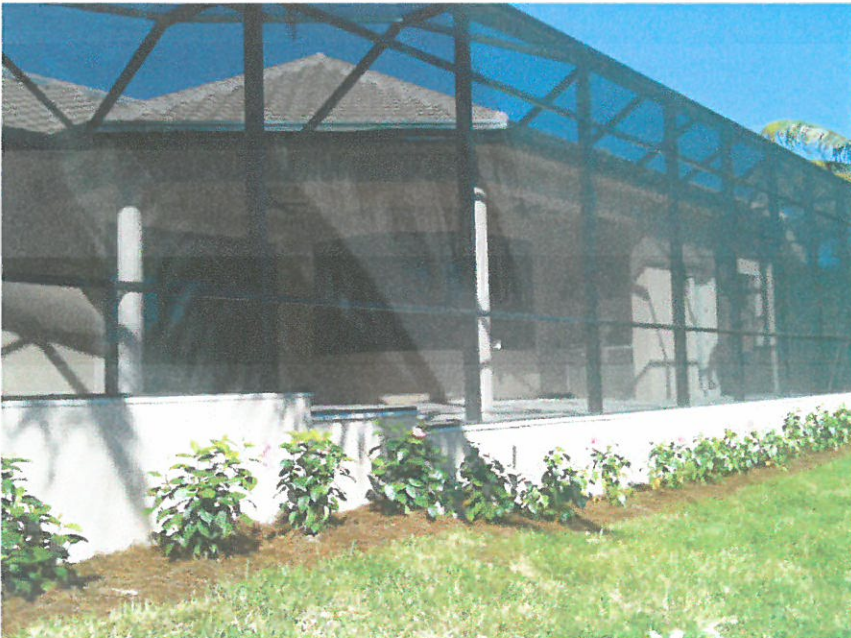
REAR VIEW 1/16/2014