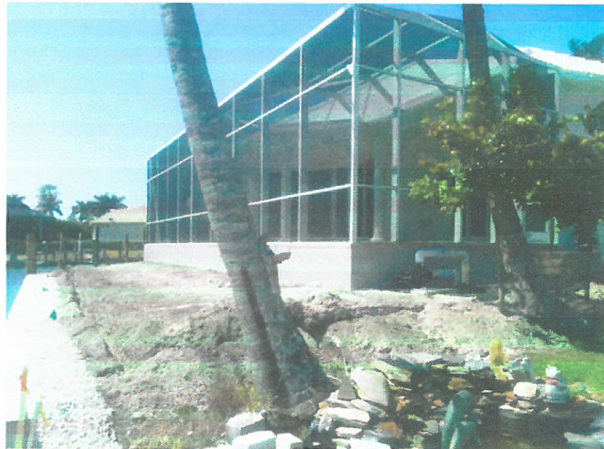
REAR VIEW 3/12/2014