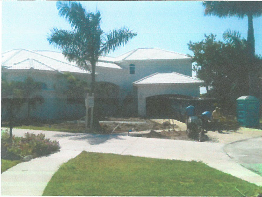
FRONT VIEW 3/12/2014

If using the Elevation Certificate to obtain NFIP flood insurance, affix at least 2 building photographs below according to the instructions for Item A6. Identify all photographs with date taken; "Front View" and "Rear View"; and, if required, "Right Side View" and "Left Side View." When applicable, photographs must show the foundation with representative examples of the flood openings or vents, as indicated in Section A8. If submitting more photographs than will fit on this page, use the Continuation Page.