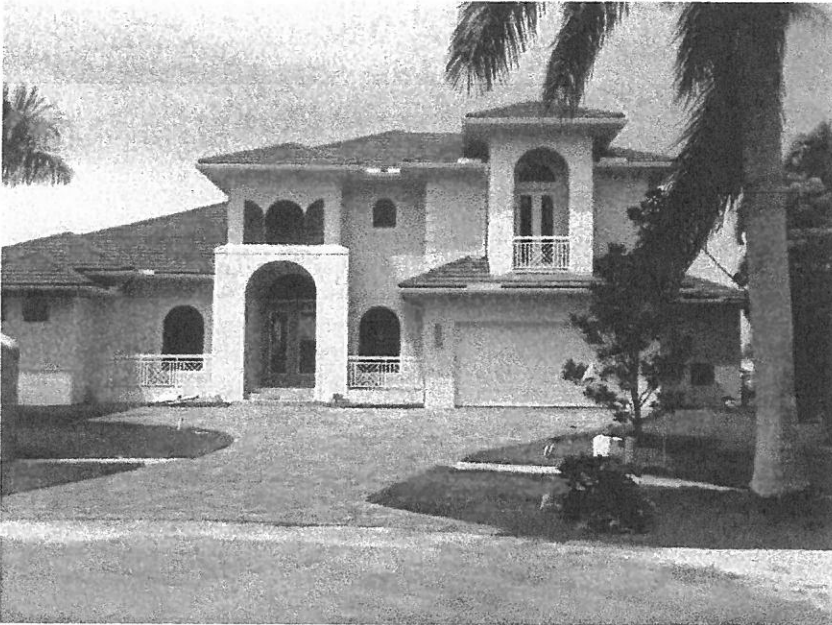
FRONT VIEW 7/1/2014

If using the Elevation Certificate to obtain NFIP flood insurance, affix at least 2 building photographs below according to the instructions for Item A6. Identify all photographs with date taken; "Front View" and "Rear View"; and, if required, "Right Side View" and "Left Side View." When applicable, photographs must show the foundation with representative examples of the flood openings or vents, as indicated in Section A8. If submitting more photographs than will fit on this page, use the Continuation Page.