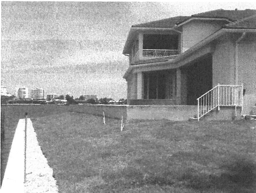
REAR VIEW 7/1/2014