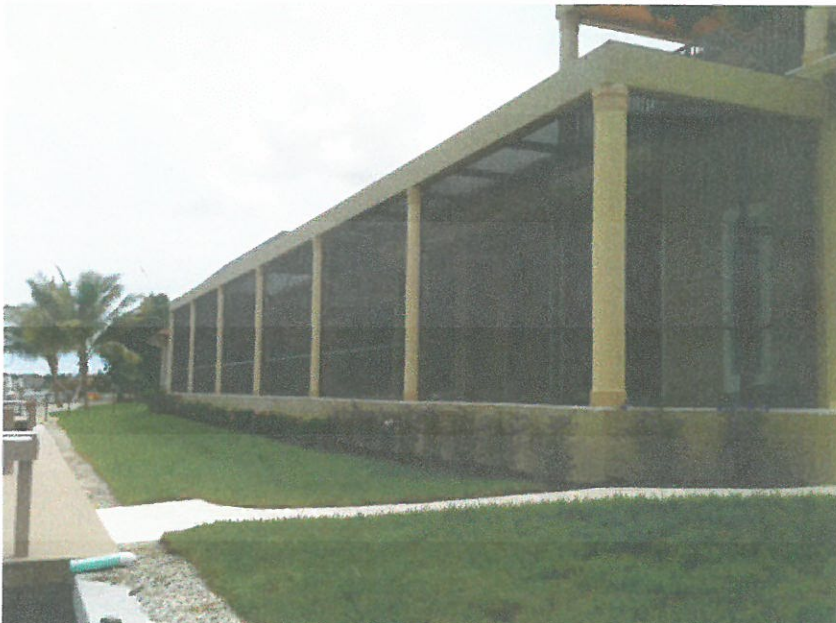
REAR VIEW 9/20/2013