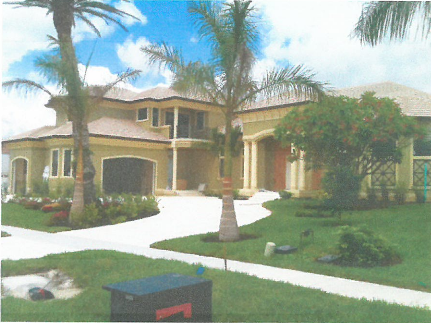
FRONT VIEW 9/20/2013

If using the Elevation Certificate to obtain NFIP flood insurance, affix at least 2 building photographs below according to the instructions for Item A6. Identify all photographs with date taken; "Front View" and "Rear View"; and, if required, "Right Side View" and "Left Side View." When applicable, photographs must show the foundation with representative examples of the flood openings or vents, as indicated in Section A8. If submitting more photographs than will fit on this page, use the Continuation Page.