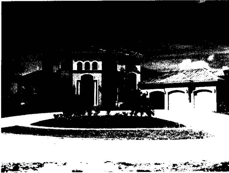
Front View 03/31/08

If using the Elevation Certificate to obtain NFIP flood insurance, affix at least two building photographs below according to the instructions for Item A6. Identify all photographs with: date taken; "Front View" and "Rear View"; and, if required, "Right Side View" and "Left Side View." If submitting more photographs than will fit on this page, use the Continuation Page, following.