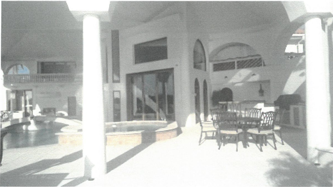
REAR VIEW (SOUTHEAST) January 6, 2016

If submitting more photographs than will fit on the preceding page, affix the additional photographs below. Identify all photographs with: date taken; "Front View" and "Rear View"; and, if required, "Right Side View" and "Left Side View." When applicable, photographs must show the foundation with representative examples of the flood openings or vents, as indicated in Section A8.