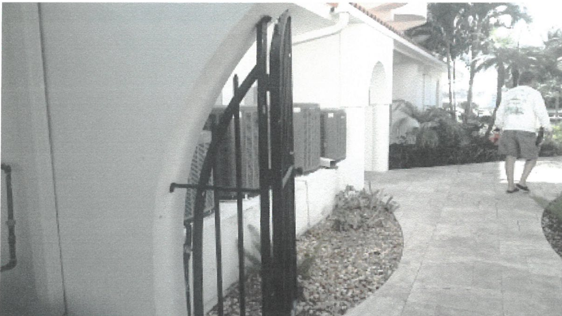
RIGHT VIEW (NORTHWEST) January 6, 2016