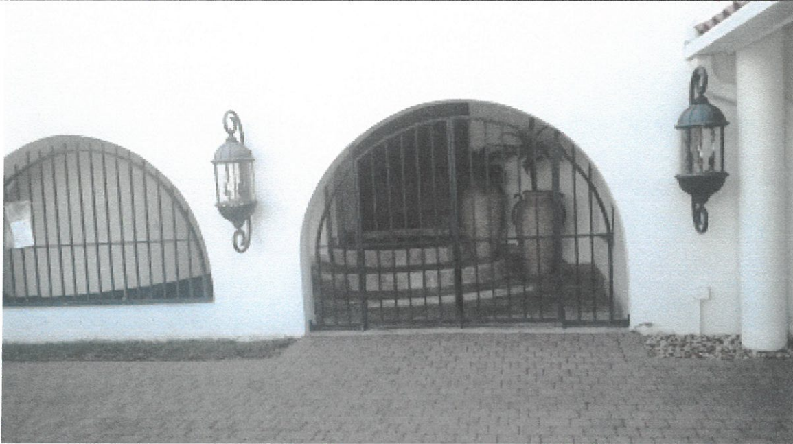
FRONT VIEW (NORTH) January 6, 2016

If using the Elevation Certificate to obtain NFIP flood insurance, affix at least 2 building photographs below according to the instructions for Item A6. Identify all photographs with date taken; "Front View" and "Rear View"; and, if required, "Right Side View" and "Left Side View." When applicable, photographs must show the foundation with representative examples of the flood openings or vents, as indicated in Section A8. If submitting more photographs than will fit on this page, use the Continuation Page.