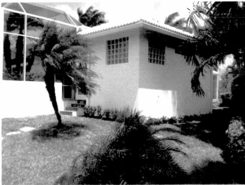
Rear View 4/6/2012