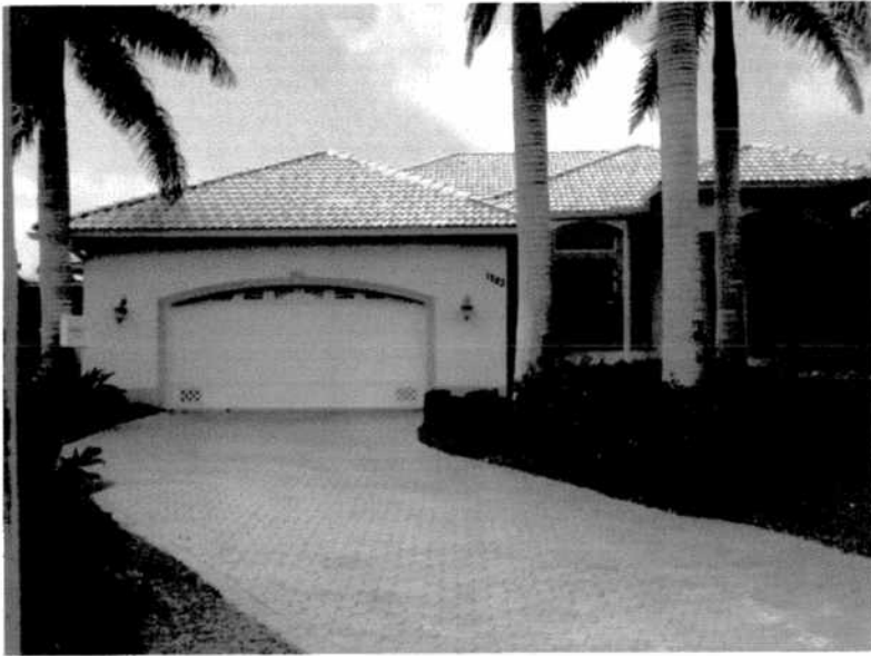
Front View 4/6/2012

If using the Elevation Certificate to obtain NFIP flood insurance, affix at least two building photographs below according to the instructions for Item A6. Identify all photographs with: date taken; "Front View" and "Rear View"; and, if required, "Right Side View" and "Left Side View." If submitting more photographs than will fit on this page, use the Continuation Page, following.