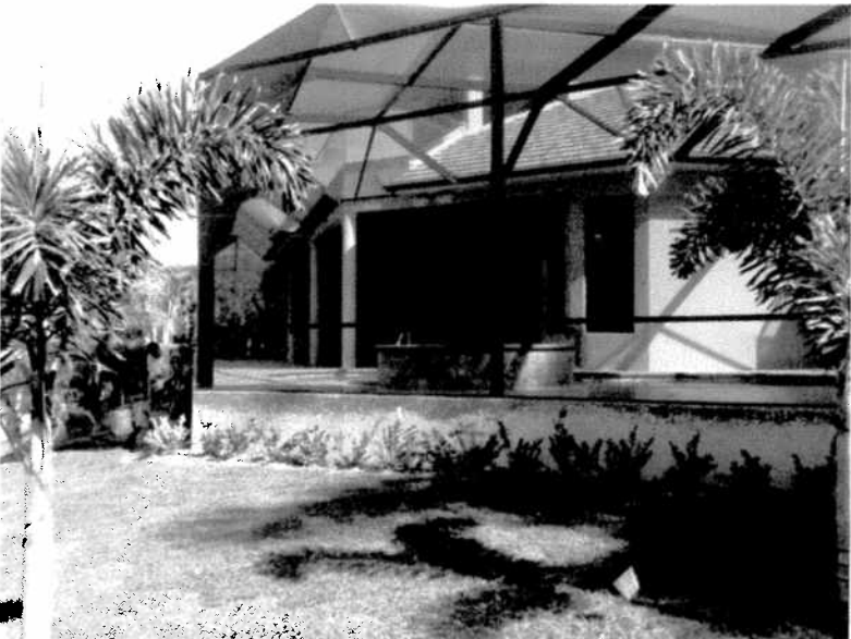
Rear View 2/23/2012