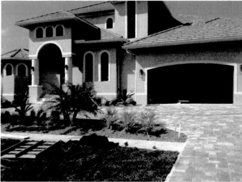
Front View 2/23/2012