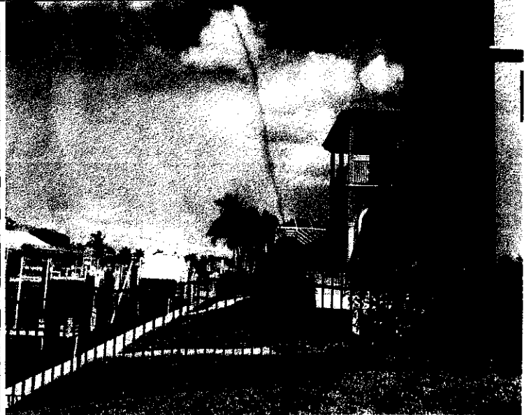
Rear View: 11/28/2010