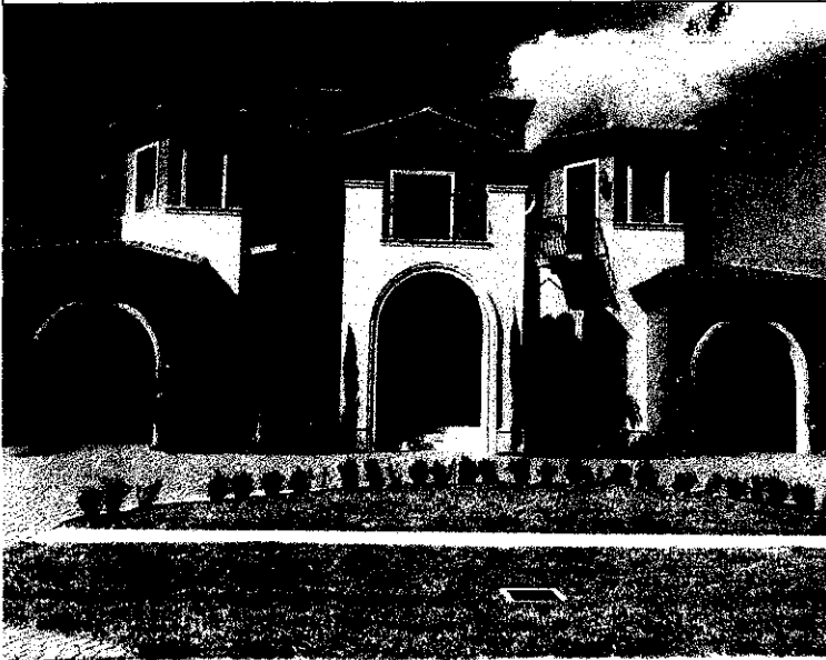
Front View: 11/28/2010

If using the Elevation Certificate to obtain NFIP flood insurance, affix at least two building photographs below according to the instructions for Item A6. Identify all photographs with: date taken; "Front View" and "Rear View"; and, if required, "Right Side View" and "Left Side View." If submitting more photographs than will fit on this page, use the Continuation Page, following.