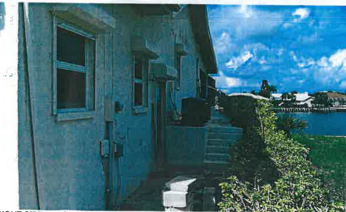
RIGHT SIDE VIEW - 08/15/11