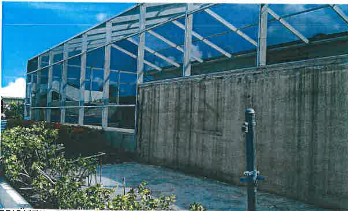
REAR VIEW - 08/15/11