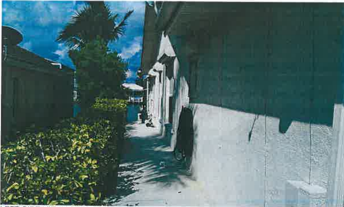
LEFT SIDE VIEW - 08/15/11

If submitting more photographs than will fit on the preceding page, affix the additional photographs below. Identify all photographs with: date taken; "Front View" and "Rear View"; and, if required, "Right Side View" and "Left Side View."