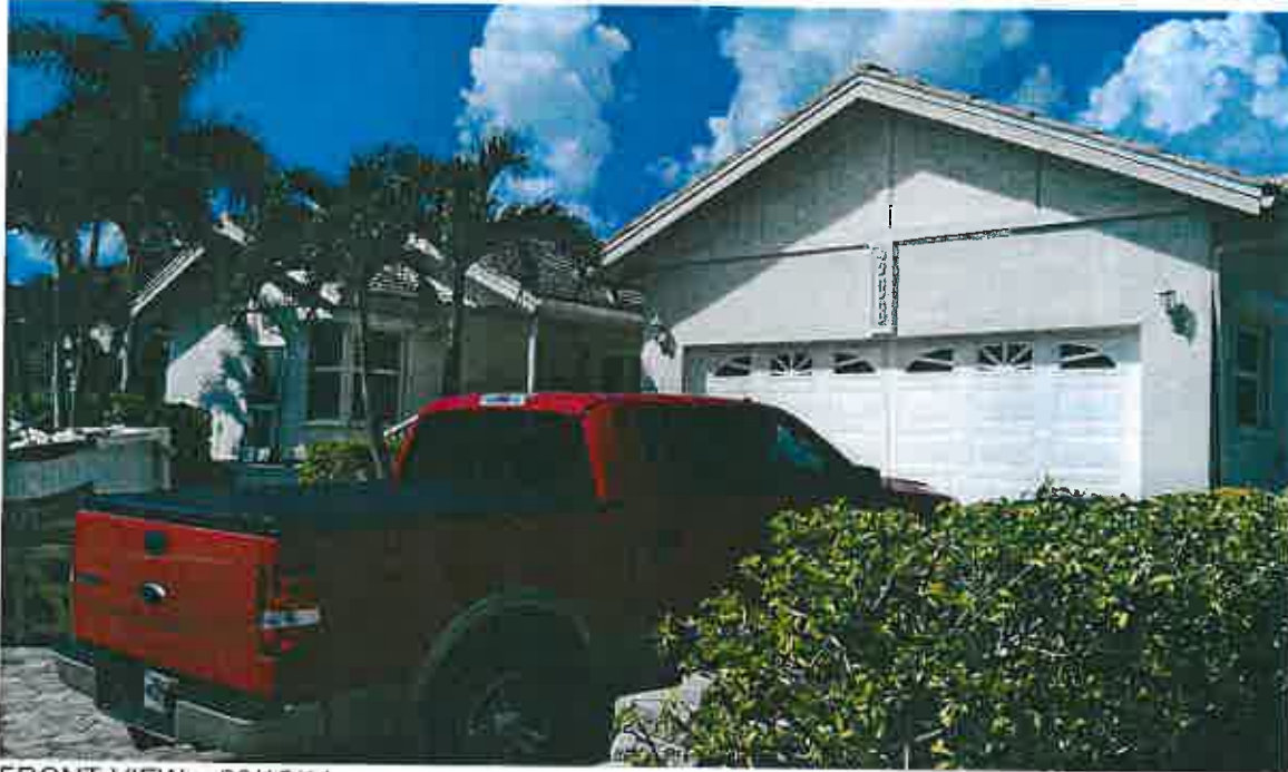
FRONT VIEW - 08/15/11

If using the Elevation Certificate to obtain NFIP flood insurance, affix at least two building photographs below according to the instructions for Item A6. Identify all photographs with: date taken; "Front View" and "Rear View"; and, if required, "Right Side View" and "Left Side View." If submitting more photographs than will fit on this page, use the Continuation Page, following.