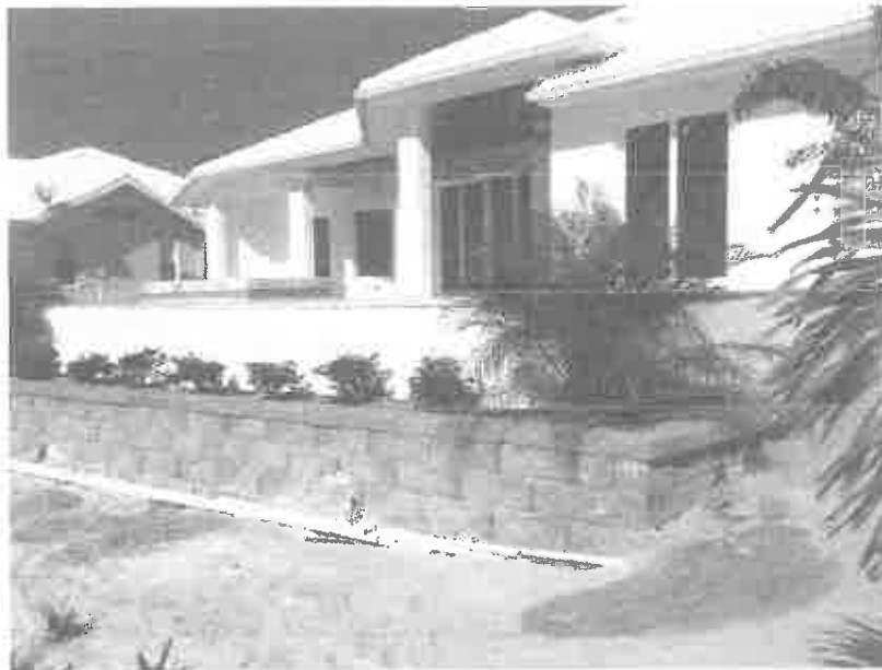
REAR VIEW 1/29/2013