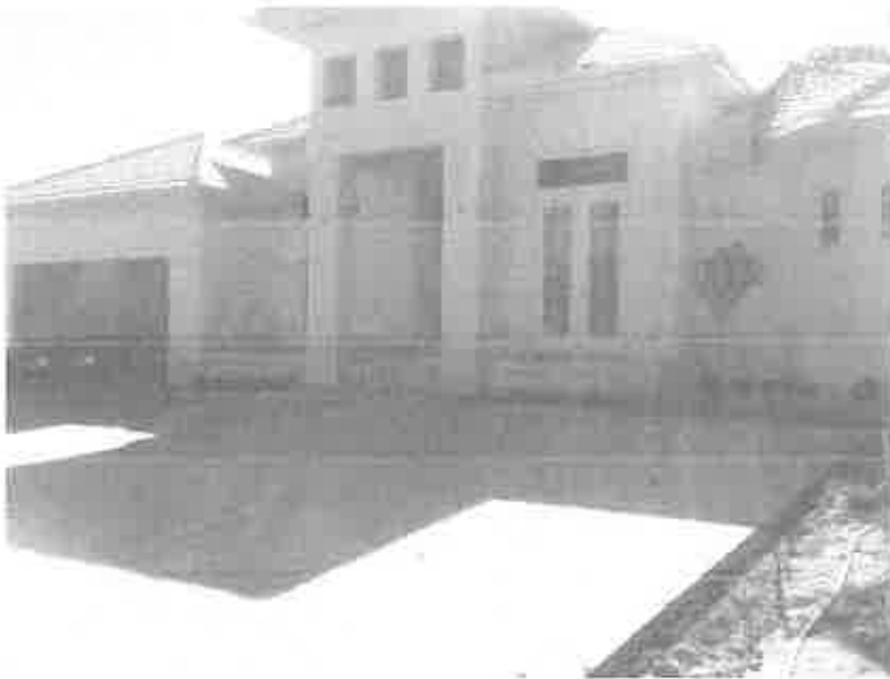
FRONT VIEW 1/29/2013

If using the Elevation Certificate to obtain NFIP flood insurance, affix at least 2 building photographs below according to the instructions for Item A6. Identify all photographs with date taken; "Front View" and "Rear View"; and, if required, "Right Side View" and "Left Side View." When applicable, photographs must show the foundation with representative examples of the flood openings or vents, as indicated in Section A8. If submitting more photographs than will fit on this page, use the Continuation Page.