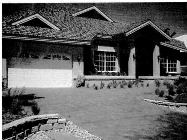
Front Property Picture 5/31/2008

If using the Elevation Certificate to obtain NFIP flood insurance, affix at least two building photographs below according to the instructions for Item A6. Identify all photographs with: date taken; "Front View" and "Rear View"; and, if required, "Right Side View" and "Left Side View." If submitting more photographs than will fit on this page, use the Continuation Page, following.