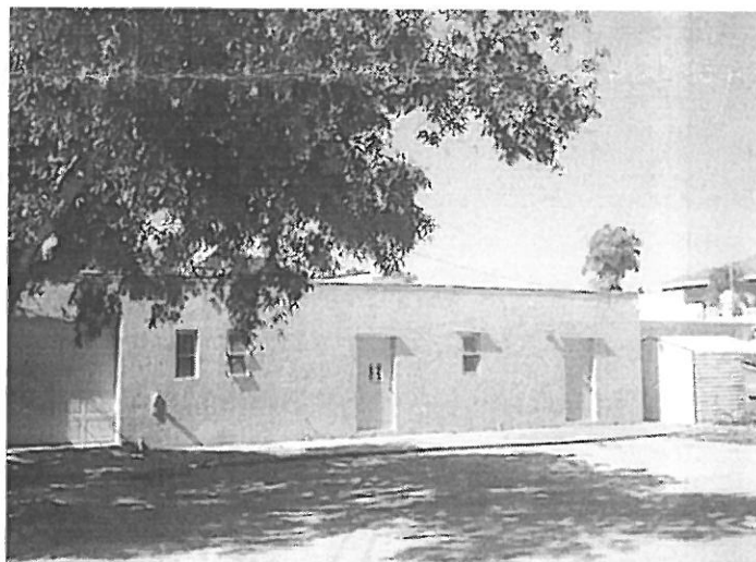
Rear Property Picture 11/20/2012