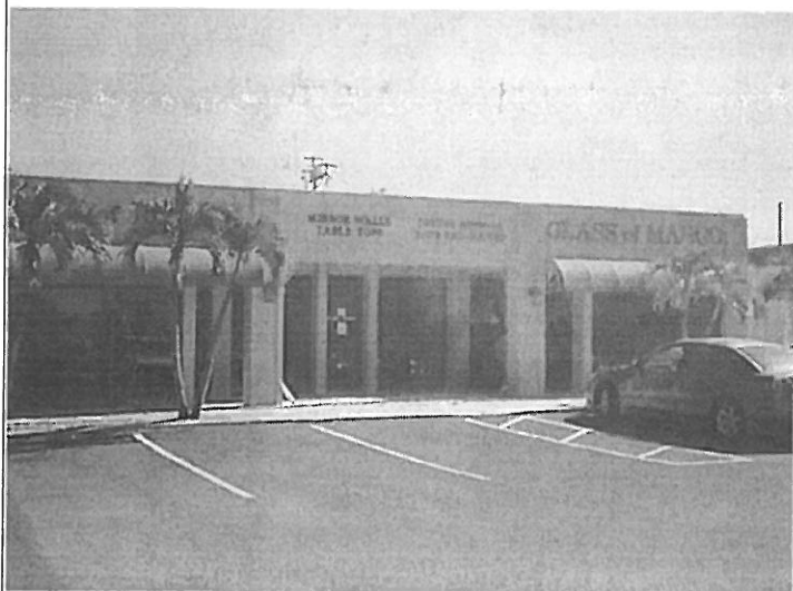
Front Property Picture 11/20/2012

If using the Elevation Certificate to obtain NFIP flood insurance, affix at least two building photographs below according to the instructions for Item A6. Identify all photographs with: date taken; "Front View" and "Rear View"; and, if required, "Right Side View" and "Left Side View." If submitting more photographs than will fit on this page, use the Continuation Page on the reverse.