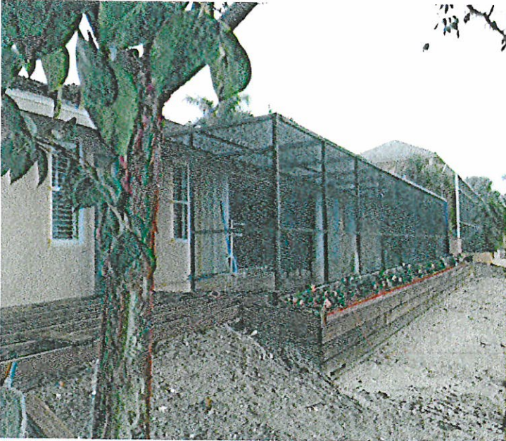
REAR VIEW 01/31/2014