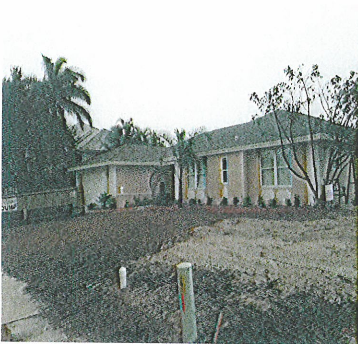
FRONT VIEW 01/31/2014