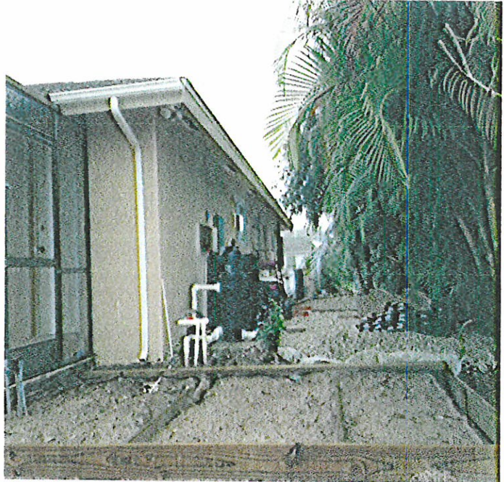
LEFT SIDE VIEW 01/31/2014