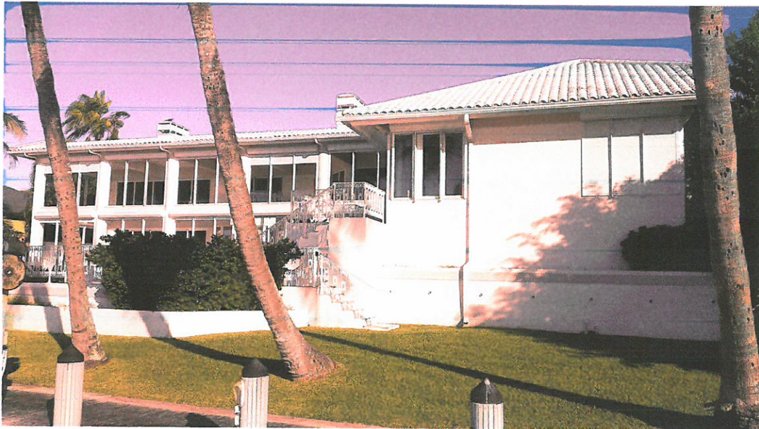
Rear View (12/13/2013)