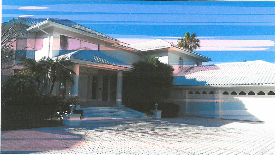
Front View (12/13/2013)

If using the Elevation Certificate to obtain NFIP flood insurance, affix at least 2 building photographs below according to the instructions for Item A6. Identify all photographs with date taken; "Front View" and "Rear View"; and, if required, "Right Side View" and "Left Side View." When applicable, photographs must show the foundation with representative examples of the flood openings or vents, as indicated in Section A8. If submitting more photographs than will fit on this page, use the Continuation Page.