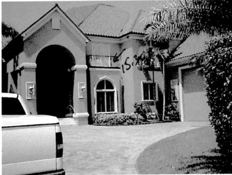
FRONT VIEW DATE TAKEN: 08/07/07

If using the Elevation Certificate to obtain NFIP flood insurance, affix at least two building photographs below according to the instructions for Item A6. Identify all photographs with: date taken; "Front View" and "Rear View"; and, if required, "Right Side View" and "Left Side View." If submitting more photographs than will fit on this page, use the Continuation Page, following.