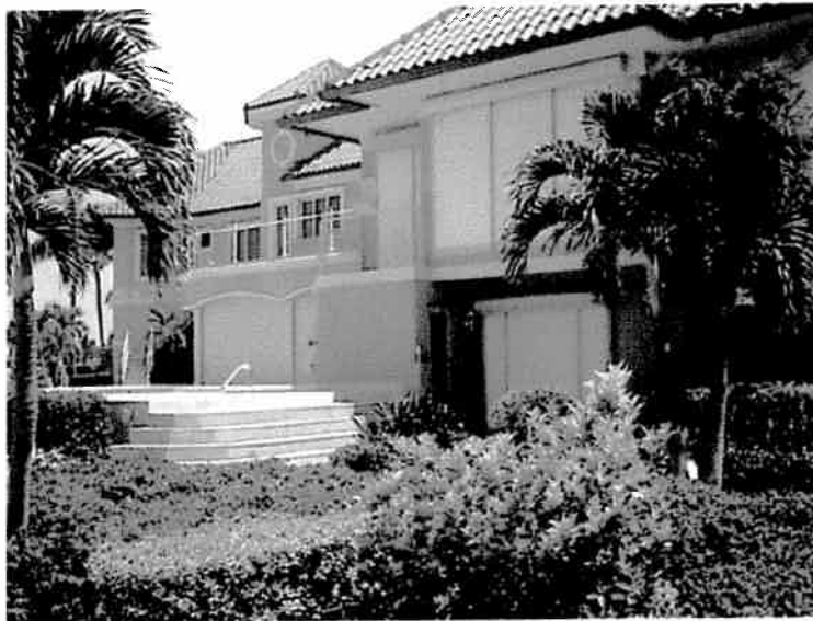
REAR VIEW DATE TAKEN: 08/07/07