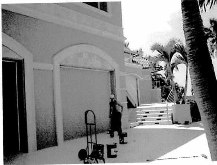
RIGHT SIDE VIEW DATE TAKEN: 08/07/07

If submitting more photographs than will fit on the preceding page, affix the additional photographs below. Identify all photographs with: date taken; "Front View" and "Rear View"; and, if required, "Right Side View" and "Left Side View."