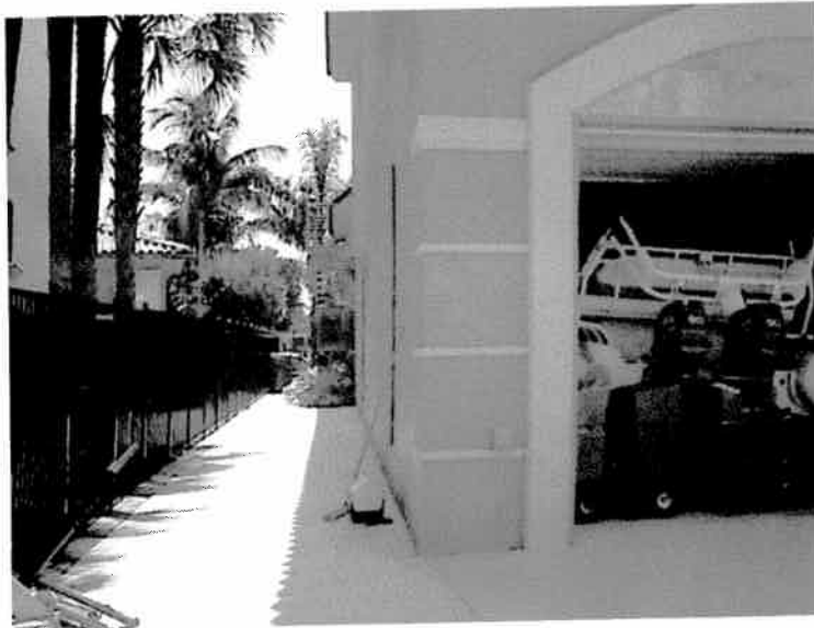
LEFT SIDE VIEW DATE TAKEN: 08/07/07