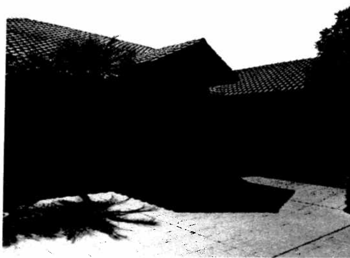
FRONT VIEW DATE TAKEN: 05/29/12

If using the Elevation Certificate to obtain NFIP flood insurance, affix at least two building photographs below according to the instructions for Item A6. Identify all photographs with: date taken; "Front View" and "Rear View"; and, if required, "Right Side View" and "Left Side View." If submitting more photographs than will fit on this page, use the Continuation Page on the reverse.