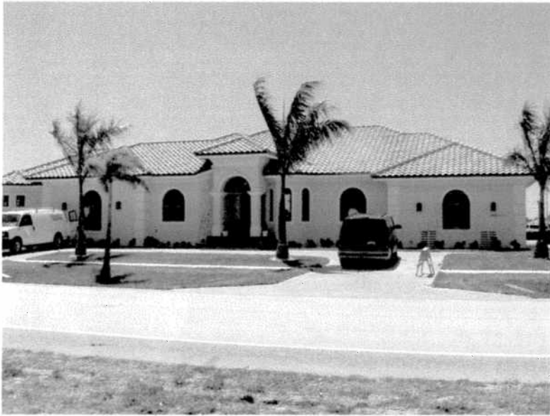
Front View 4/4/2011