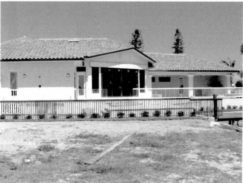
Rear View 4/4/2011