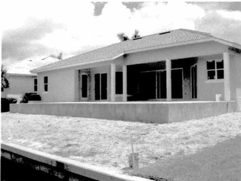
Rear View 9/2/2009