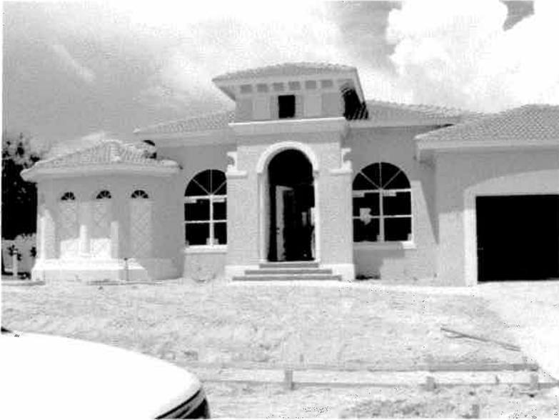
Front View 9/2/2009

If using the Elevation Certificate to obtain NFIP flood insurance, affix at least two building photographs below according to the instructions for Item A6. Identify all photographs with: date taken; "Front View" and "Rear View"; and, if required, "Right Side View" and "Left Side View." If submitting more photographs than will fit on this page, use the Continuation Page, following.