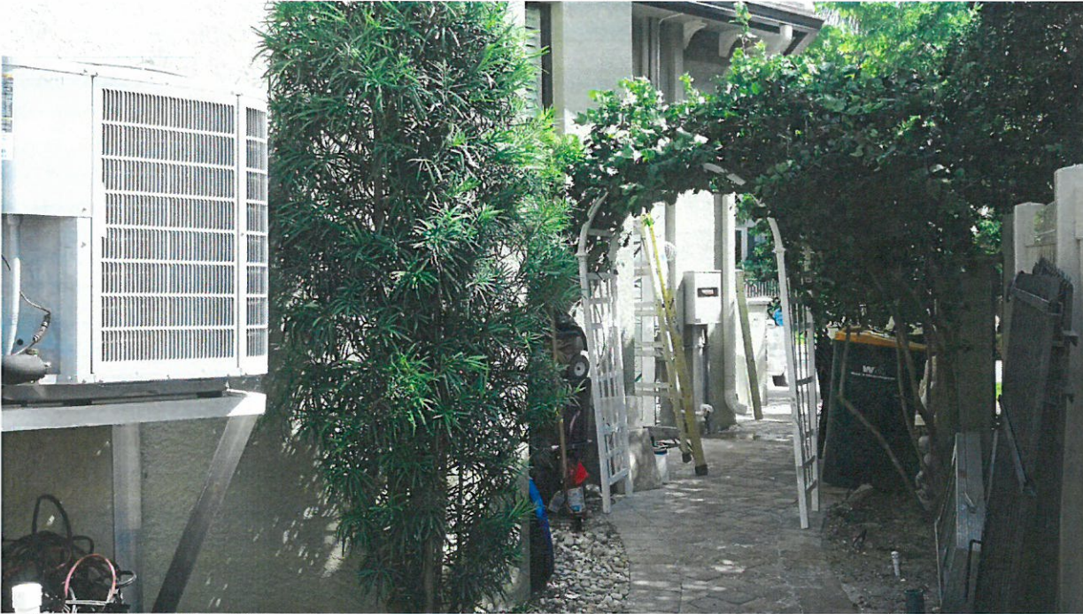
LEFT SIDE VIEW - 06/30/2013

If submitting more photographs than will fit on the preceding page, affix the additional photographs below. Identify all photographs with: date taken; "Front View" and "Rear View"; and, if required, "Right Side View" and "Left Side View." When applicable, photographs must show the foundation with representative examples of the flood openings or vents, as indicated in Section A8.