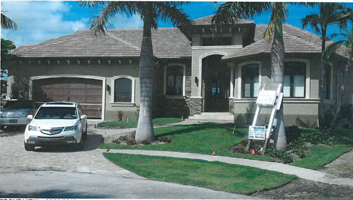
FRONT VIEW – 06/30/2013

If using the Elevation Certificate to obtain NFIP flood insurance, affix at least 2 building photographs below according to the instructions for Item A6. Identify all photographs with date taken; "Front View" and "Rear View"; and, if required, "Right Side View" and "Left Side View." When applicable, photographs must show the foundation with representative examples of the flood openings or vents, as indicated in Section A8. If submitting more photographs than will fit on this page, use the Continuation Page.