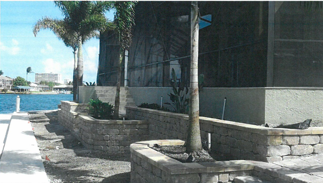
REAR VIEW - 06/30/2013