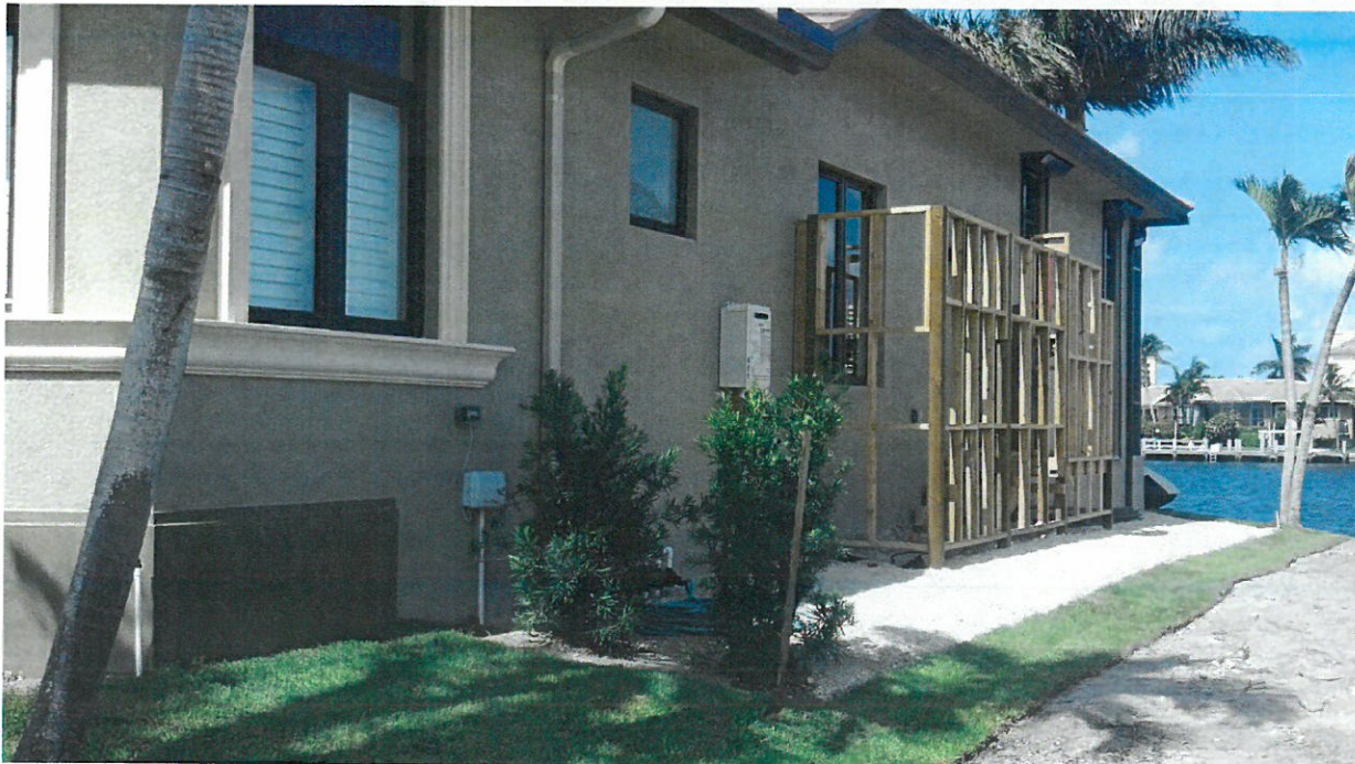
RIGHT SIDE VIEW – 06/30/2013