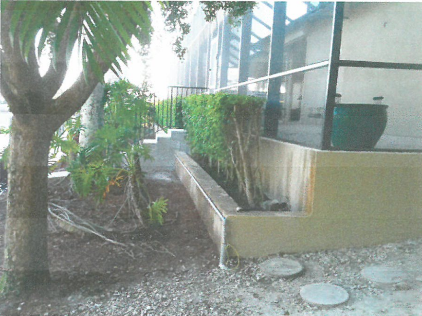
REAR VIEW 2/12/2014