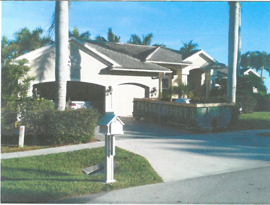
FRONT VIEW 2/12/2014

If using the Elevation Certificate to obtain NFIP flood insurance, affix at least 2 building photographs below according to the instructions for Item A6. Identify all photographs with date taken; "Front View" and "Rear View"; and, if required, "Right Side View" and "Left Side View." When applicable, photographs must show the foundation with representative examples of the flood openings or vents, as indicated in Section A8. If submitting more photographs than will fit on this page, use the Continuation Page.