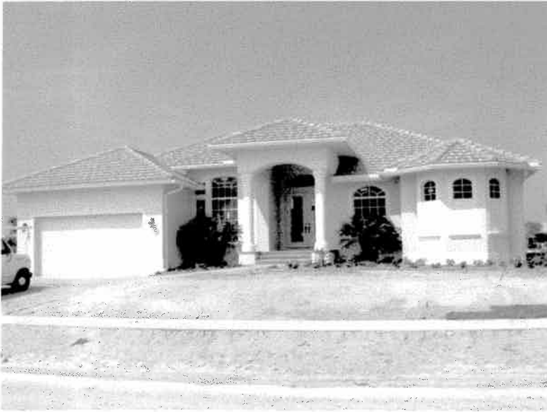
Front View 03/14/08

If using the Elevation Certificate to obtain NFIP flood insurance, affix at least two building photographs below according to the instructions for Item A6. Identify all photographs with: date taken; "Front View" and "Rear View"; and, if required, "Right Side View" and "Left Side View." If submitting more photographs than will fit on this page, use the Continuation Page, following.