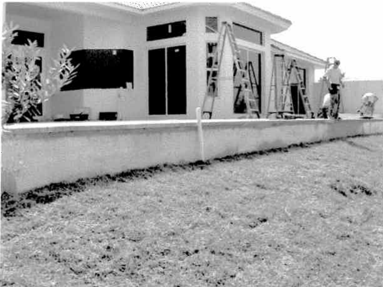
Rear View 03-14-08