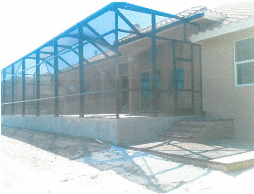
REAR VIEW 10/28/2013