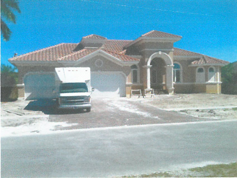
FRONT VIEW 10/28/2013

If using the Elevation Certificate to obtain NFIP flood insurance, affix at least 2 building photographs below according to the instructions for Item A6. Identify all photographs with date taken; "Front View" and "Rear View"; and, if required, "Right Side View" and "Left Side View." When applicable, photographs must show the foundation with representative examples of the flood openings or vents, as indicated in Section A8. If submitting more photographs than will fit on this page, use the Continuation Page.