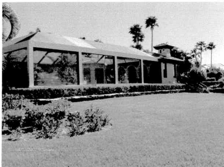
Rear View 4/02/07