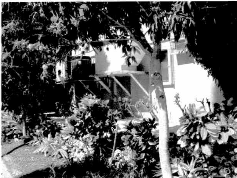
Left Side View 4/02/07

If using the Elevation Certificate to obtain NFIP flood insurance, affix at least two building photographs below according to the instructions for Item A6. Identify all photographs with: date taken; "Front View" and "Rear View"; and, if required, "Right Side View" and "Left Side View." If submitting more photographs than will fit on this page, use the Continuation Page, following.