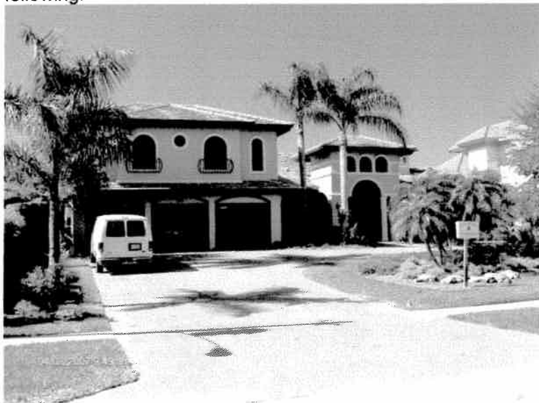
Front View 4/02/07

If using the Elevation Certificate to obtain NFIP flood insurance, affix at least two building photographs below according to the instructions for Item A6. Identify all photographs with: date taken; "Front View" and "Rear View"; and, if required, "Right Side View" and "Left Side View." If submitting more photographs than will fit on this page, use the Continuation Page, following.