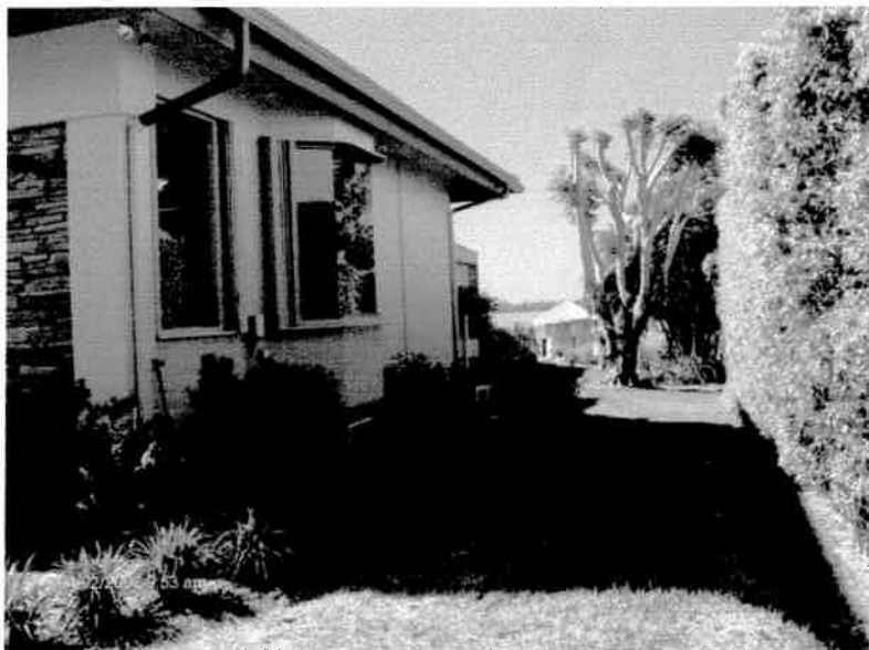
Right Side View 4/02/07