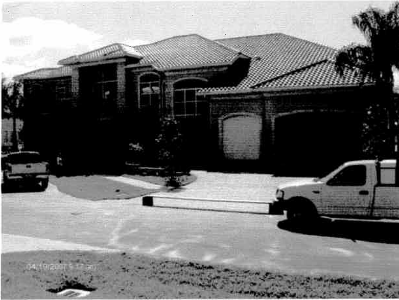
Front View 4/19/07

If using the Elevation Certificate to obtain NFIP flood insurance, affix at least two building photographs below according to the instructions for Item A6. Identify all photographs with: date taken; "Front View" and "Rear View"; and, if required, "Right Side View" and "Left Side View." If submitting more photographs than will fit on this page, use the Continuation Page, following.