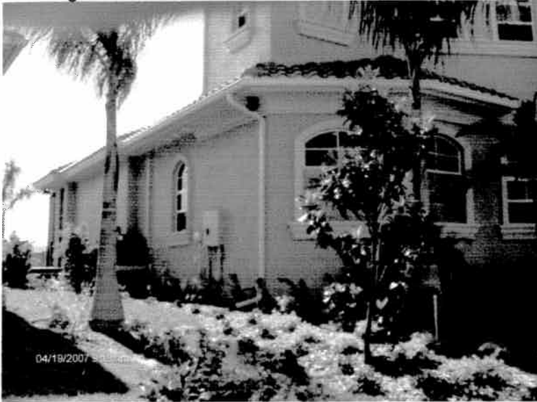
Left Side View 4/19/07

If using the Elevation Certificate to obtain NFIP flood insurance, affix at least two building photographs below according to the instructions for Item A6. Identify all photographs with: date taken; "Front View" and "Rear View"; and, if required, "Right Side View" and "Left Side View." If submitting more photographs than will fit on this page, use the Continuation Page, following.