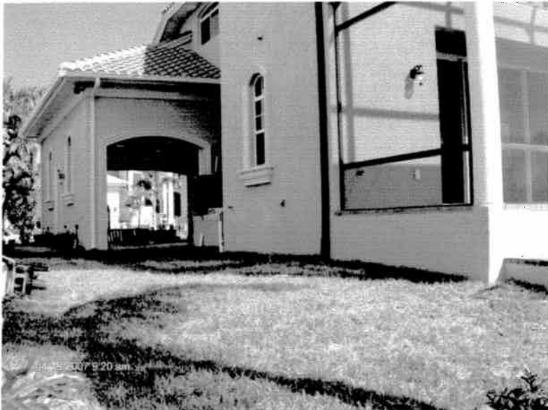
Right Side View 4/19/07