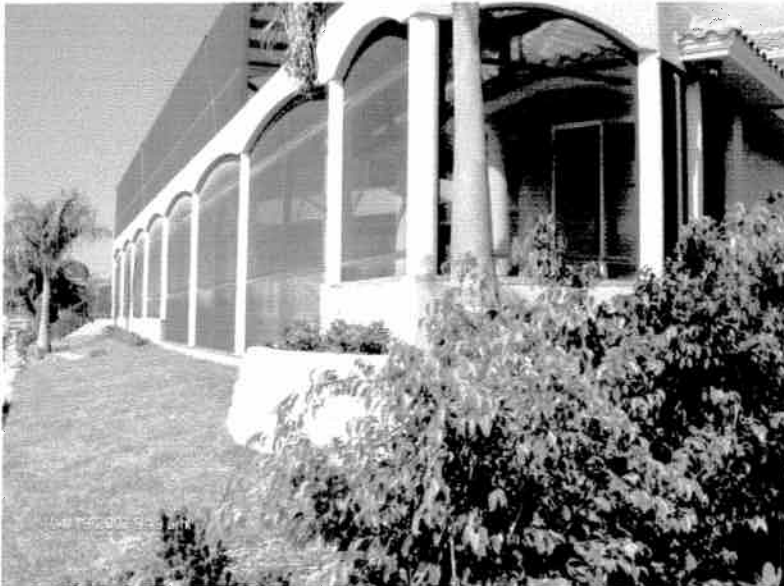
Rear View 4/19/07