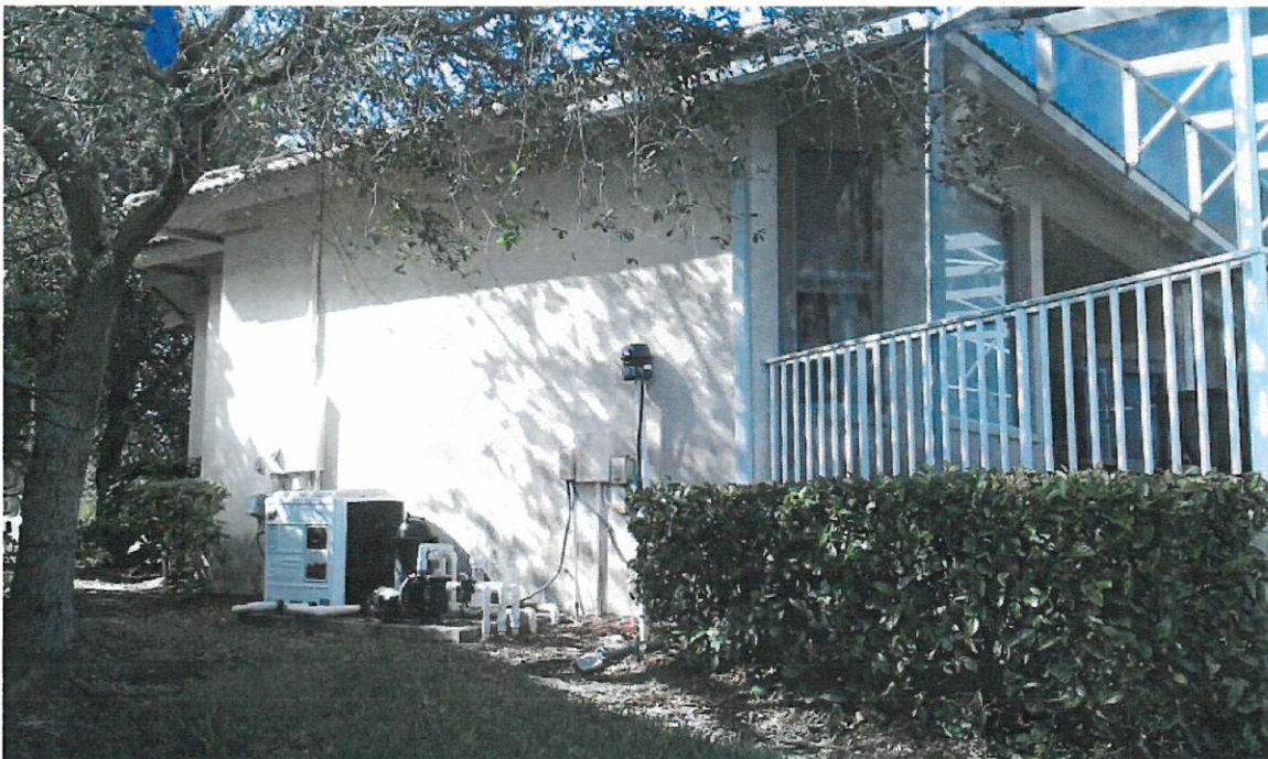
RIGHT SIDE VIEW – 12/06/2013