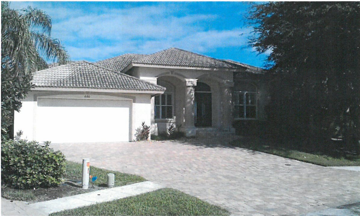
FRONT VIEW – 12/06/2013

If using the Elevation Certificate to obtain NFIP flood insurance, affix at least 2 building photographs below according to the instructions for Item A6. Identify all photographs with date taken; "Front View" and "Rear View"; and, if required, "Right Side View" and "Left Side View." When applicable, photographs must show the foundation with representative examples of the flood openings or vents, as indicated in Section A8. If submitting more photographs than will fit on this page, use the Continuation Page.