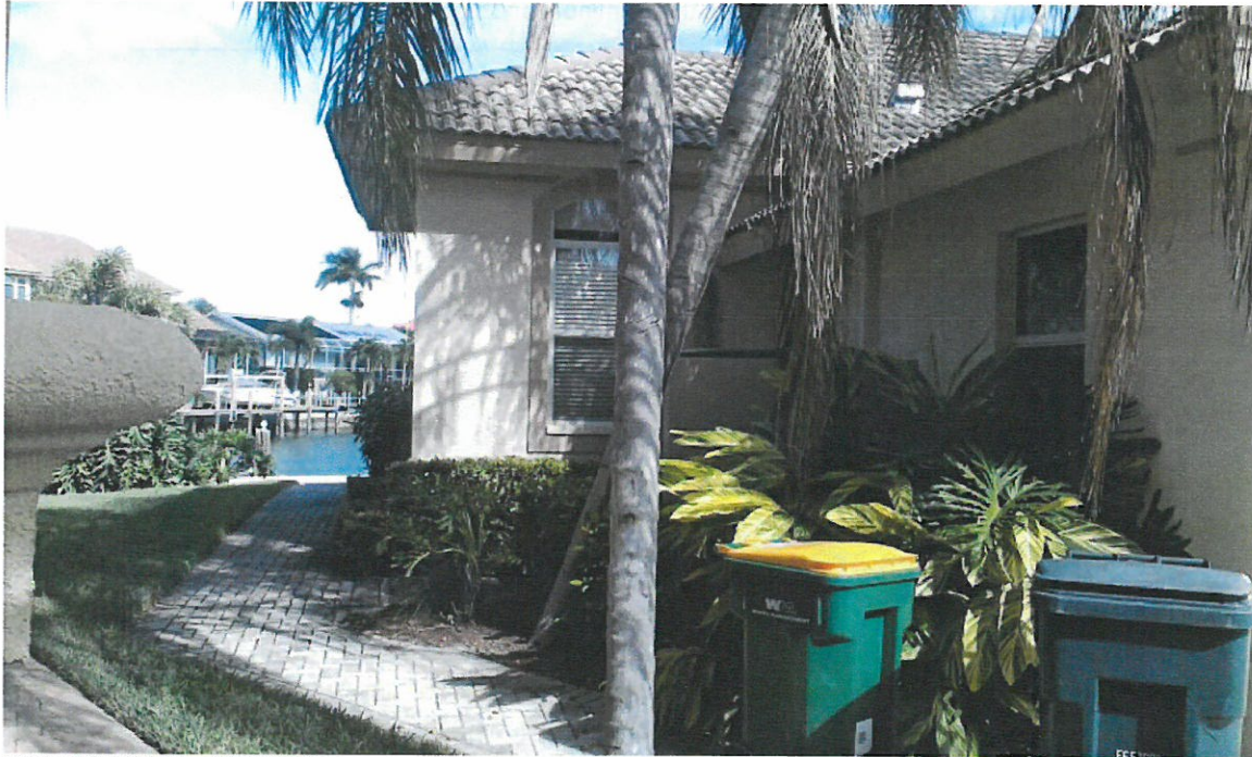
LEFT SIDE VIEW – 12/06/2013

If submitting more photographs than will fit on the preceding page, affix the additional photographs below. Identify all photographs with: date taken; "Front View" and "Rear View"; and, if required, "Right Side View" and "Left Side View." When applicable, photographs must show the foundation with representative examples of the flood openings or vents, as indicated in Section A8.