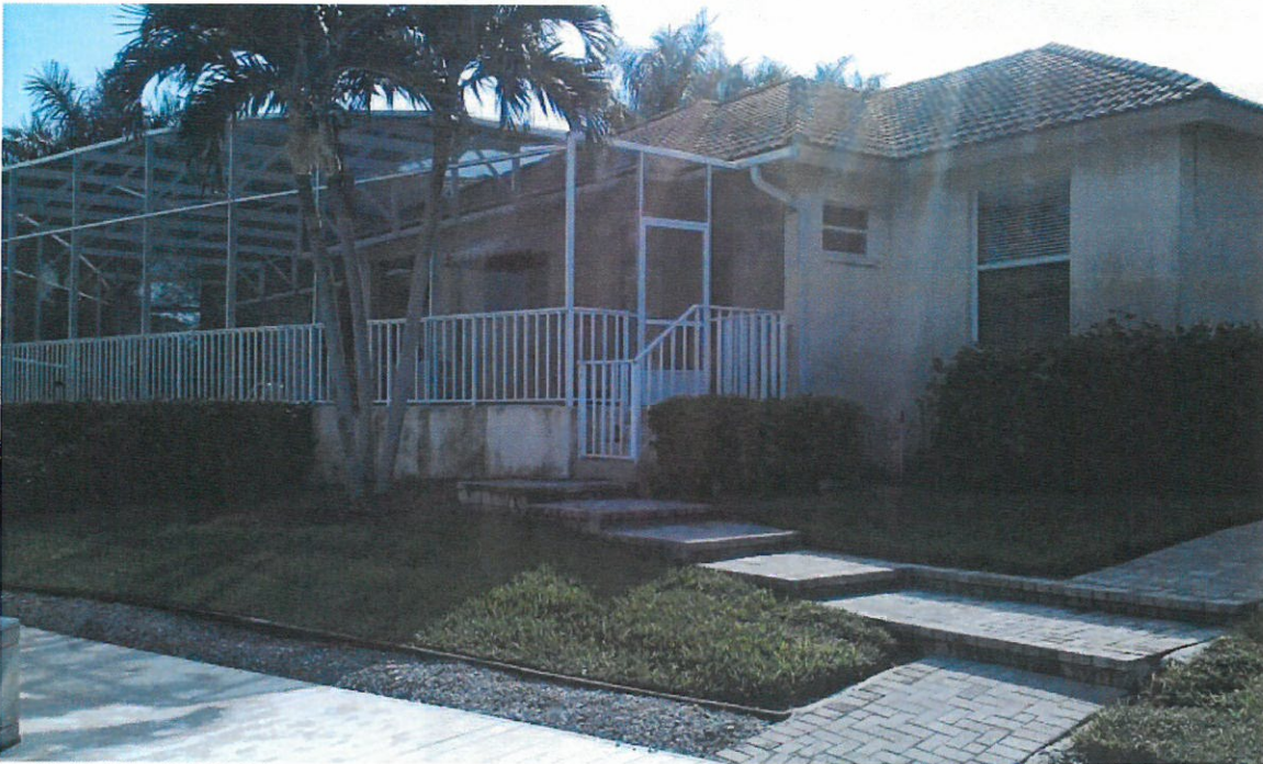
REAR VIEW – 12/06/2013