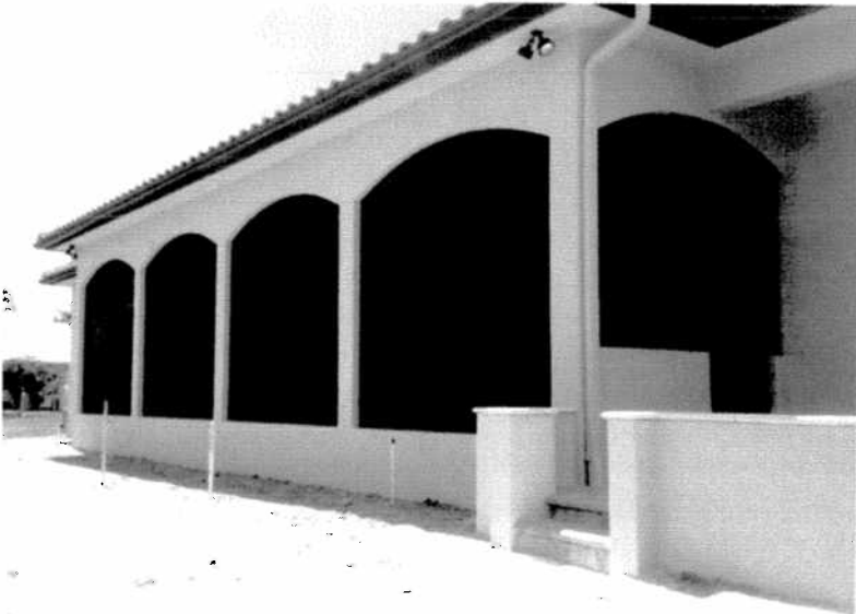
Rear View 3/28/2012