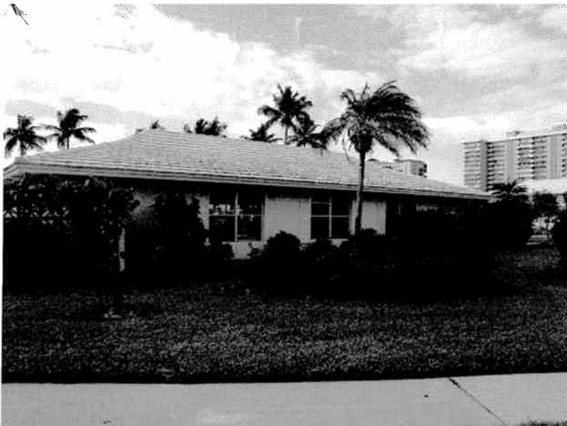
Rear View 04/15/08