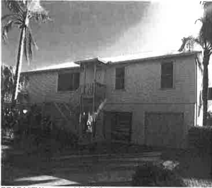
FRONT VIEW 11-29-12