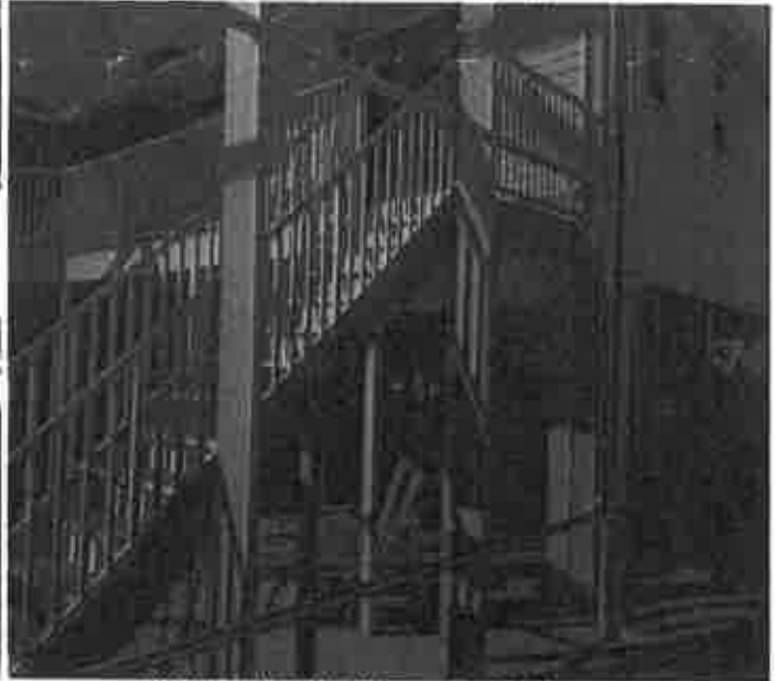
LEFT SIDE VIEW 11-29-12