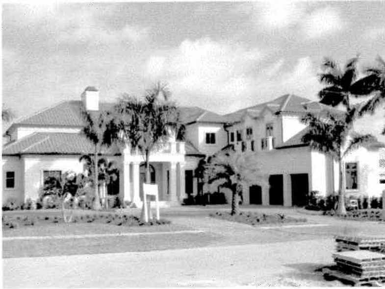
Front View 04/28/08

If using the Elevation Certificate to obtain NFIP flood insurance, affix at least two building photographs below according to the instructions for Item A6. Identify all photographs with: date taken; "Front View" and "Rear View"; and, if required, "Right Side View" and "Left Side View." If submitting more photographs than will fit on this page, use the Continuation Page, following.