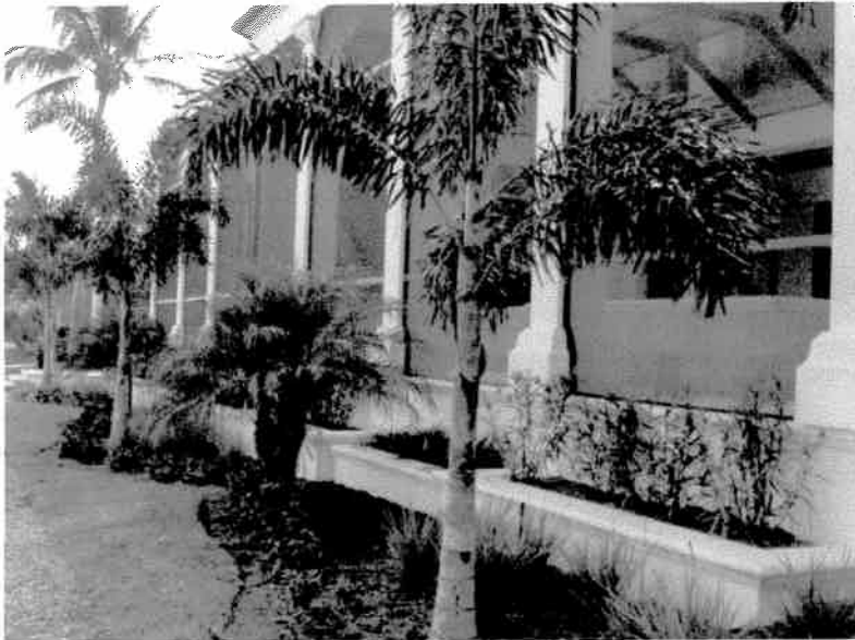
Rear View 04/28/08