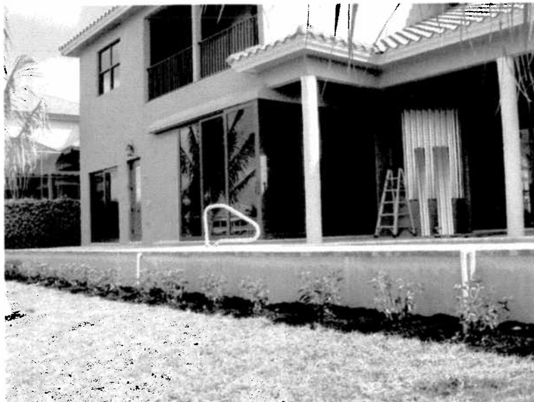
Rear View 3/21/2011