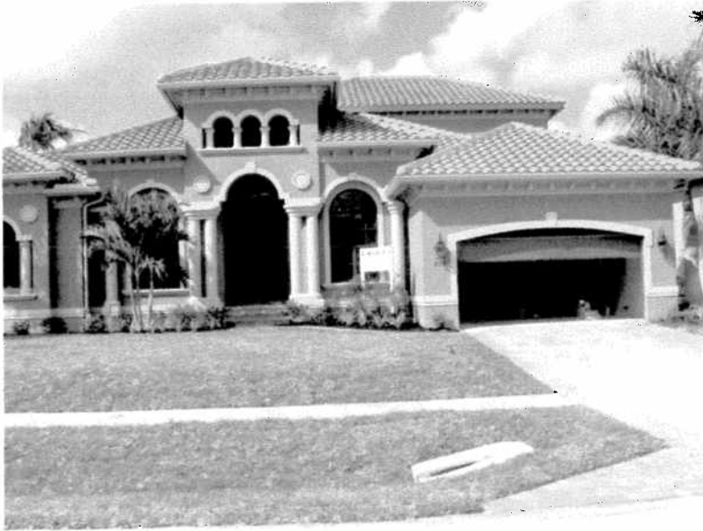
Front View 3/21/2011

If using the Elevation Certificate to obtain NFIP flood insurance, affix at least two building photographs below according to the instructions for Item A6. Identify all photographs with: date taken; "Front View" and "Rear View"; and, if required, "Right Side View" and "Left Side View." If submitting more photographs than will fit on this page, use the Continuation Page, following.