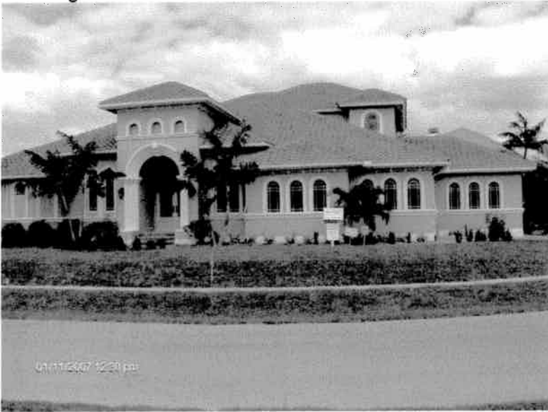
Front View 1/11/07

If using the Elevation Certificate to obtain NFIP flood insurance, affix at least two building photographs below according to the instructions for Item A6. Identify all photographs with: date taken; "Front View" and "Rear View"; and, if required, "Right Side View" and "Left Side View." If submitting more photographs than will fit on this page, use the Continuation Page, following.