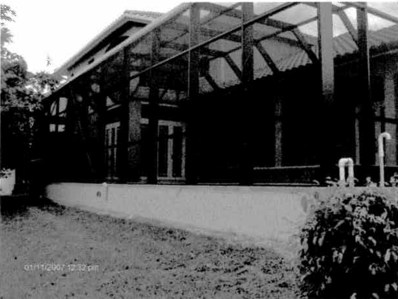
Rear View 1/11/07