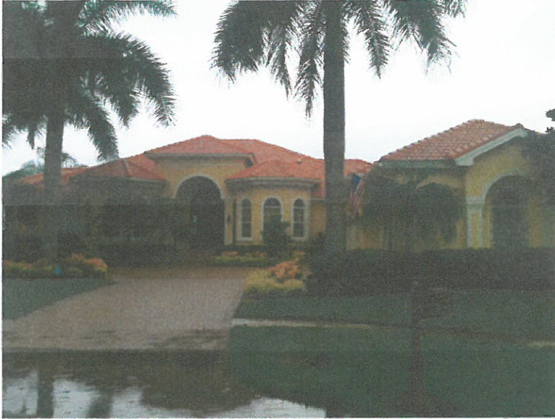
FRONT VIEW 9/20/2014

If using the Elevation Certificate to obtain NFIP flood insurance, affix at least 2 building photographs below according to the instructions for Item A6. Identify all photographs with date taken; "Front View" and "Rear View"; and, if required, "Right Side View" and "Left Side View." When applicable, photographs must show the foundation with representative examples of the flood openings or vents, as indicated in Section A8. If submitting more photographs than will fit on this page, use the Continuation Page.