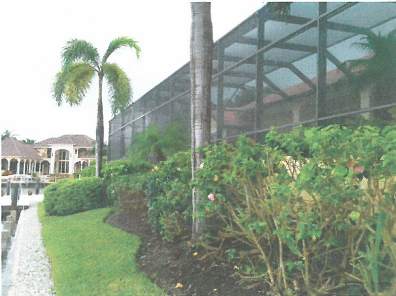
REAR VIEW 9/20/2014