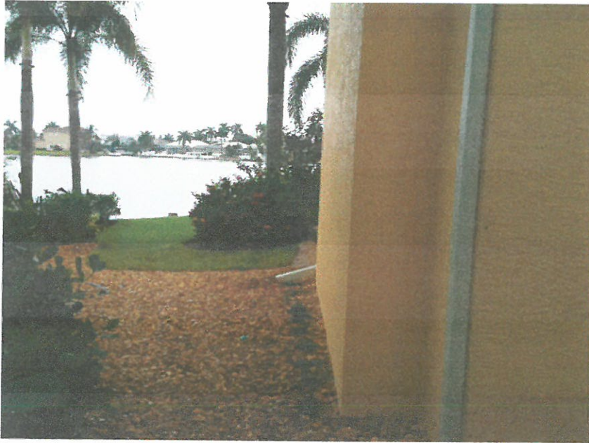
LEFT SIDE VIEW 9/20/2014

If submitting more photographs than will fit on the preceding page, affix the additional photographs below. Identify all photographs with: date taken; "Front View" and "Rear View"; and, if required, "Right Side View" and "Left Side View." When applicable, photographs must show the foundation with representative examples of the flood openings or vents, as indicated in Section A8.