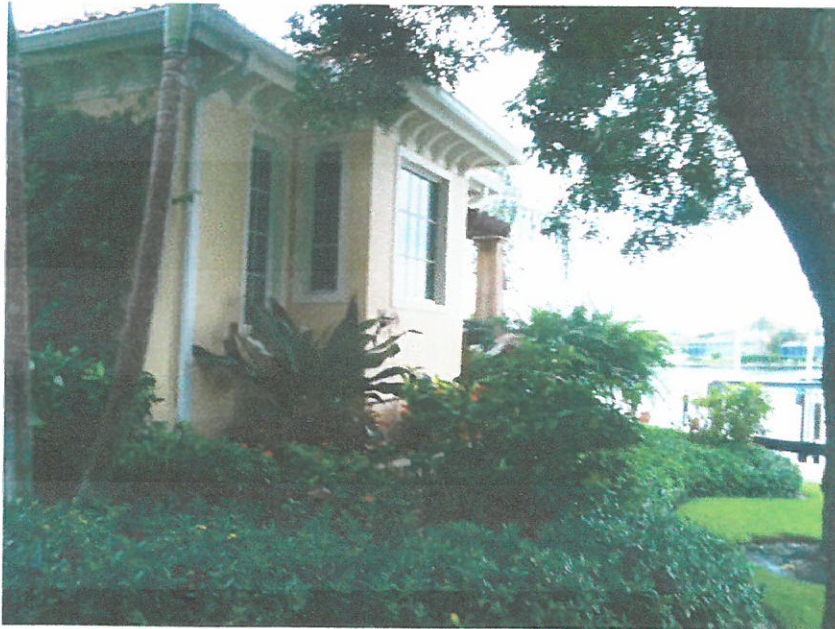
RIGHT SIDE VIEW 9/20/2014