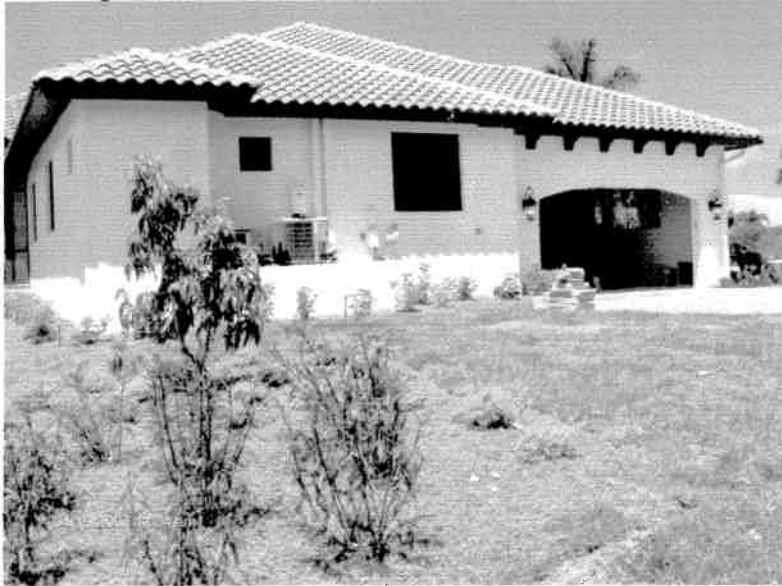
Left Side View 4/19/07

If using the Elevation Certificate to obtain NFIP flood insurance, affix at least two building photographs below according to the instructions for Item A6. Identify all photographs with: date taken; "Front View" and "Rear View"; and, if required, "Right Side View" and "Left Side View." If submitting more photographs than will fit on this page, use the Continuation Page, following.