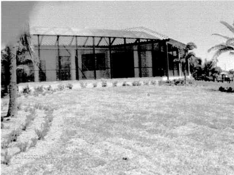
Rear View 4/19/07