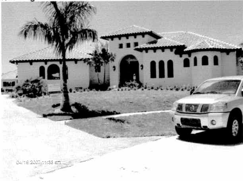
Front View 4/19/07

If using the Elevation Certificate to obtain NFIP flood insurance, affix at least two building photographs below according to the instructions for Item A6. Identify all photographs with: date taken; "Front View" and "Rear View"; and, if required, "Right Side View" and "Left Side View." If submitting more photographs than will fit on this page, use the Continuation Page, following.