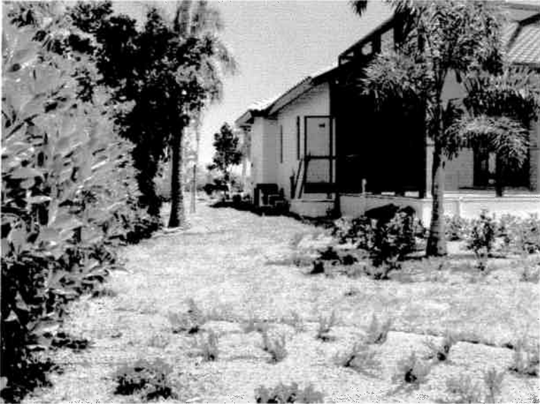
Right Side View 4/19/07