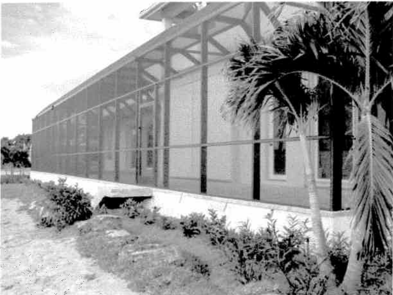
Rear View 01/04/08