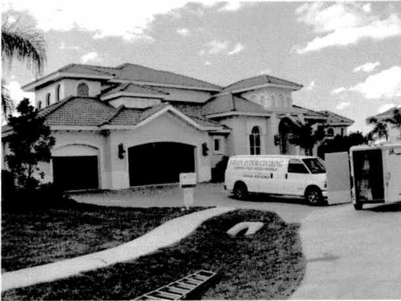
Front View 01/04/08

If using the Elevation Certificate to obtain NFIP flood insurance, affix at least two building photographs below according to the instructions for Item A6. Identify all photographs with: date taken; "Front View" and "Rear View"; and, if required, "Right Side View" and "Left Side View." If submitting more photographs than will fit on this page, use the Continuation Page, following.