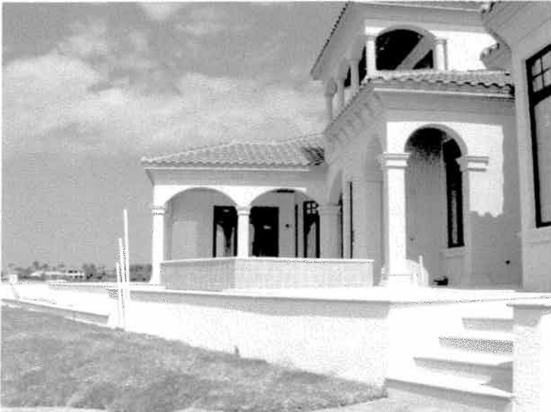
Rear View 03/10/08