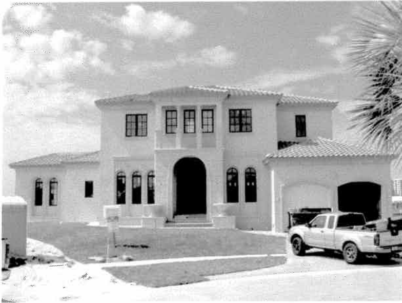
Front View 03/10/08

If using the Elevation Certificate to obtain NFIP flood insurance, affix at least two building photographs below according to the instructions for Item A6. Identify all photographs with: date taken; "Front View" and "Rear View"; and, if required, "Right Side View" and "Left Side View." If submitting more photographs than will fit on this page, use the Continuation Page, following.