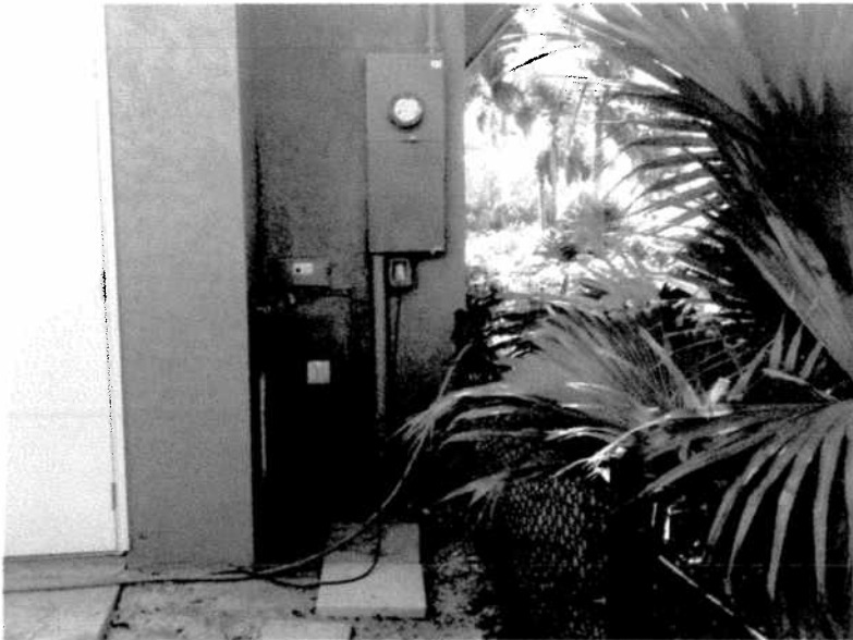
Front View 3/2/2012