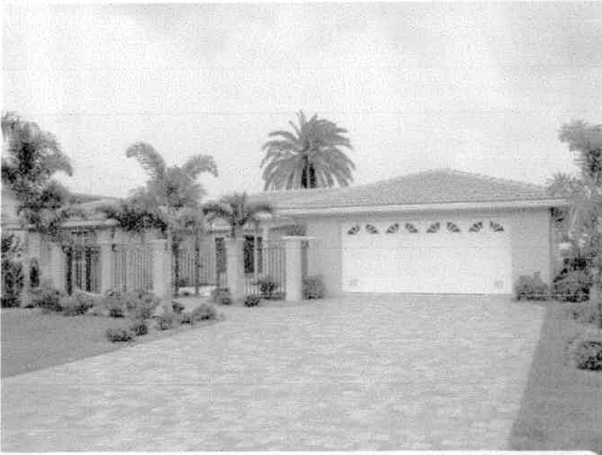
Photos taken 06/05/2009 Front and Rear views