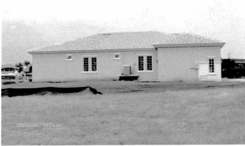
Left Side View 8/15/07

If using the Elevation Certificate to obtain NFIP flood insurance, affix at least two building photographs below according to the instructions for Item A6. Identify all photographs with: date taken, "Front View" and "Rear View"; and, if required, "Right Side View" and "Left Side View." If submitting more photographs than will fit on this page, use the Continuation Page, following.