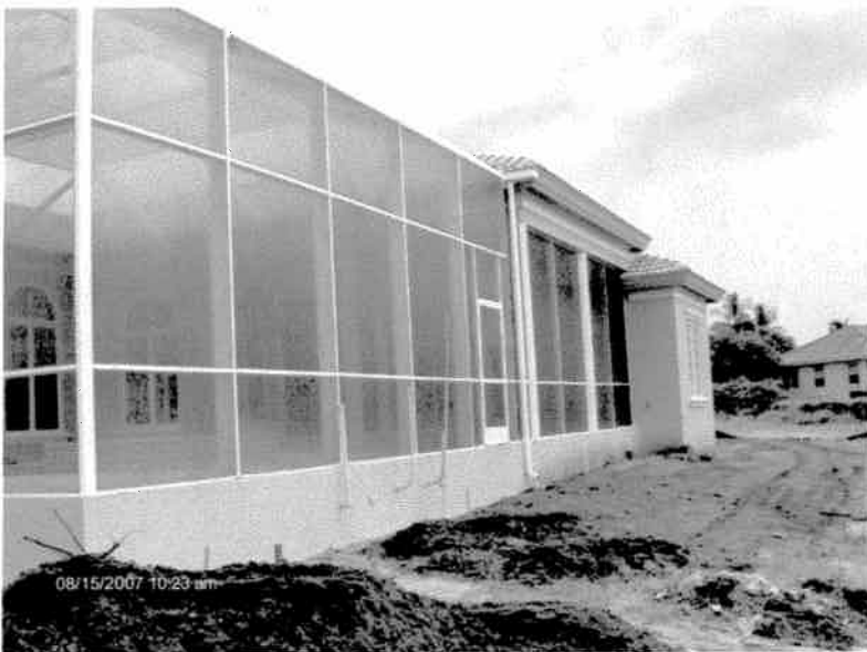
Rear View 8/15/07