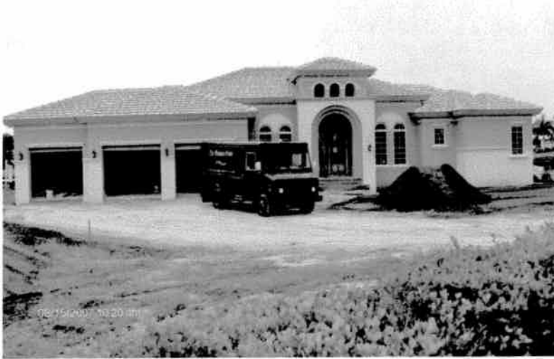
Front View 8/15/07

If using the Elevation Certificate to obtain NFIP flood insurance, affix at least two building photographs below according to the instructions for Item A6. Identify all photographs with: date taken; "Front View" and "Rear View"; and, if required, "Right Side View" and "Left Side View." If submitting more photographs than will fit on this page, use the Continuation Page, following.