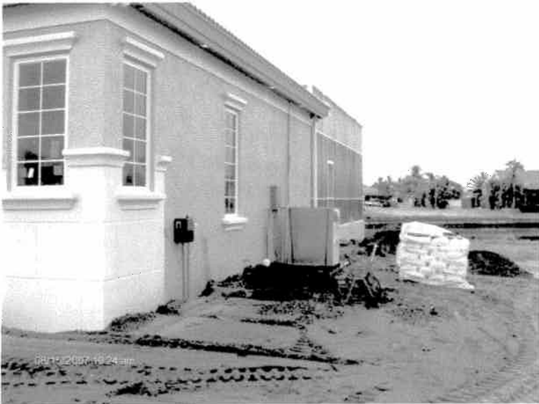
Right Side View 8/15/07