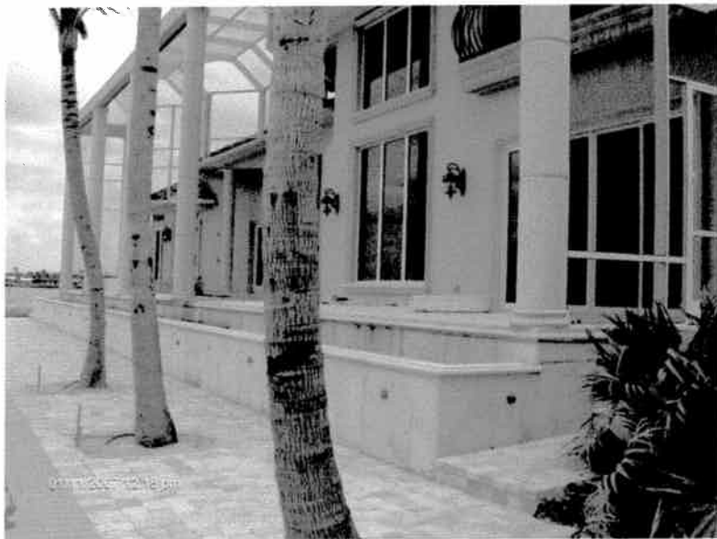
Rear View 1/11/07