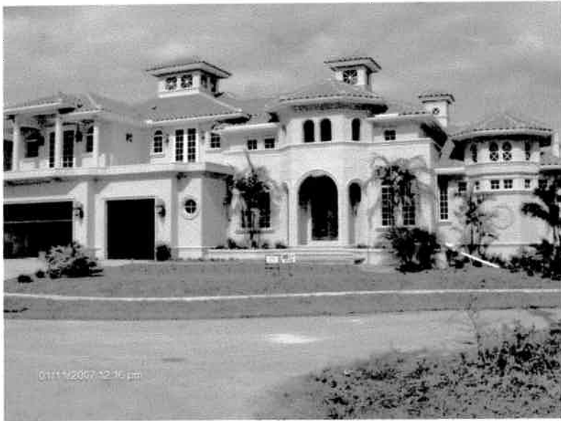
Front View 1/11/07

If using the Elevation Certificate to obtain NFIP flood insurance, affix at least two building photographs below according to the instructions for Item A6. Identify all photographs with: date taken; "Front View" and "Rear View"; and, if required, "Right Side View" and "Left Side View." If submitting more photographs than will fit on this page, use the Continuation Page, following.