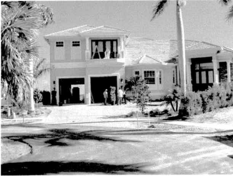
Front View 01/11/08

If using the Elevation Certificate to obtain NFIP flood insurance, affix at least two building photographs below according to the instructions for Item A6. Identify all photographs with: date taken; "Front View" and "Rear View"; and, if required, "Right Side View" and "Left Side View." If submitting more photographs than will fit on this page, use the Continuation Page, following.