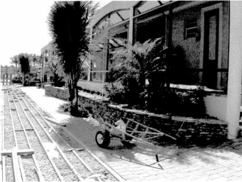
Rear View 01/11/08