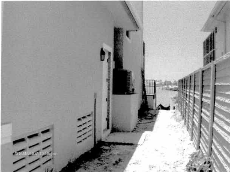
Right Side View 6/04/07