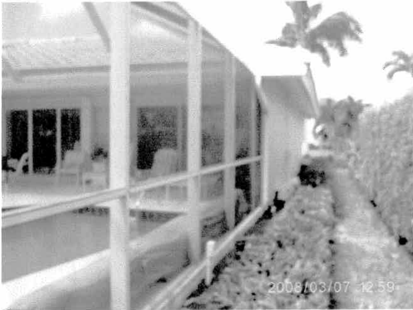
Right Side View Taken on 03/07/2008