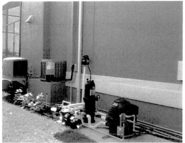
Right Side View (1)