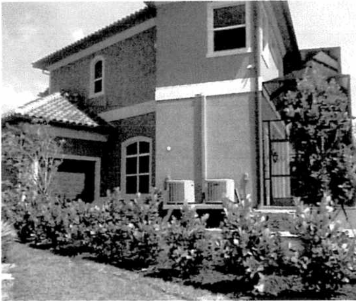
Left Side View (2)