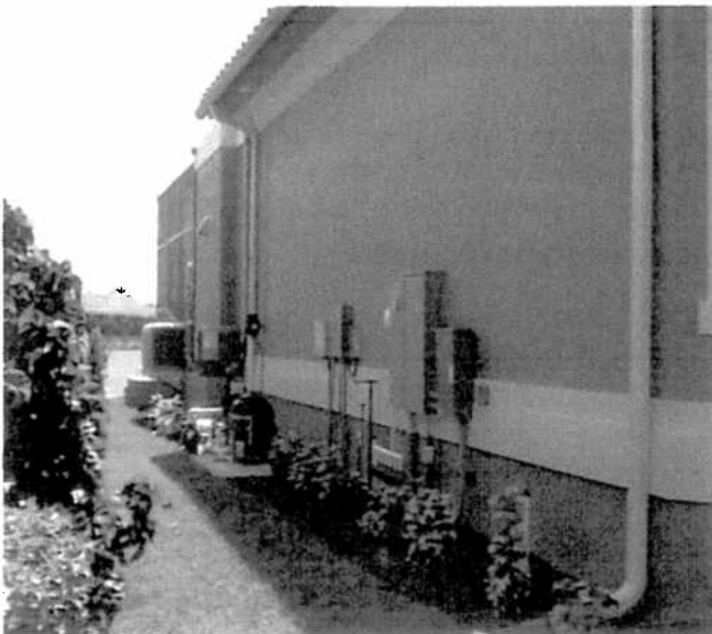
Right Side View (2)