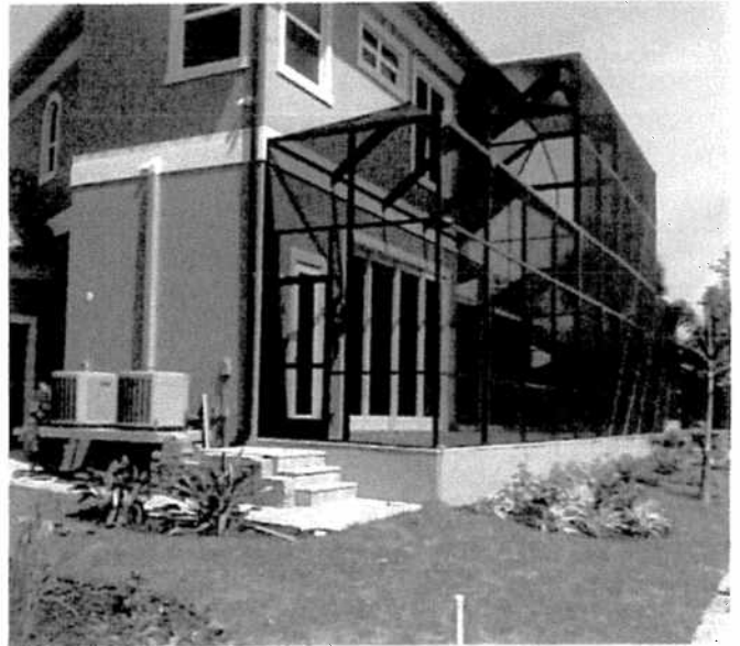
Left Rear View (1)