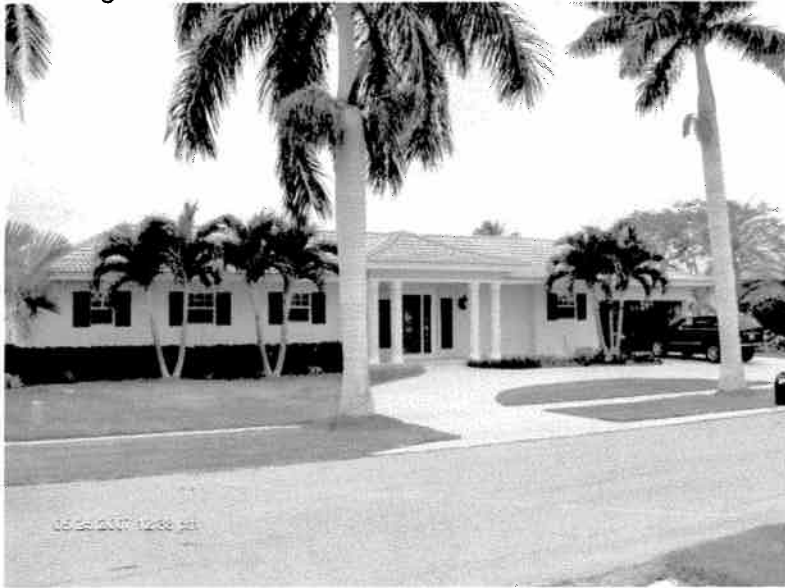
Front View 5/22/07

If using the Elevation Certificate to obtain NFIP flood insurance, affix at least two building photographs below according to the instructions for Item A6. Identify all photographs with: date taken; "Front View" and "Rear View"; and, if required, "Right Side View" and "Left Side View." If submitting more photographs than will fit on this page, use the Continuation Page, following.