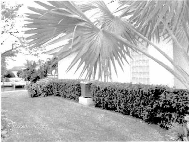
Left Side View 5/25/07

If using the Elevation Certificate to obtain NFIP flood insurance, affix at least two building photographs below according to the instructions for Item A6. Identify all photographs with: date taken; "Front View" and "Rear View"; and, if required, "Right Side View" and "Left Side View." If submitting more photographs than will fit on this page, use the Continuation Page, following.