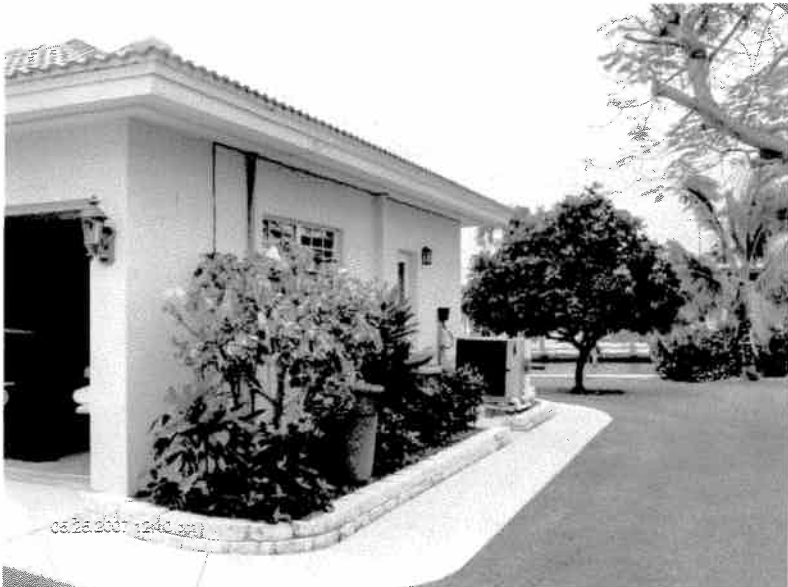
Right Side View 5/25/07