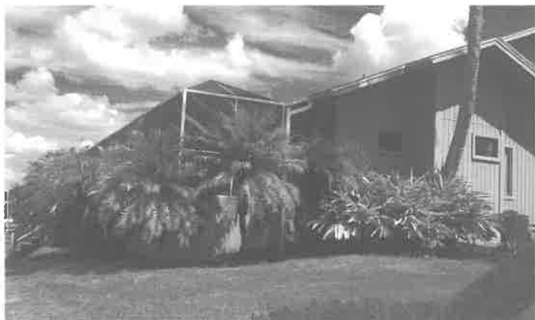
Rear View (9/27/2012)