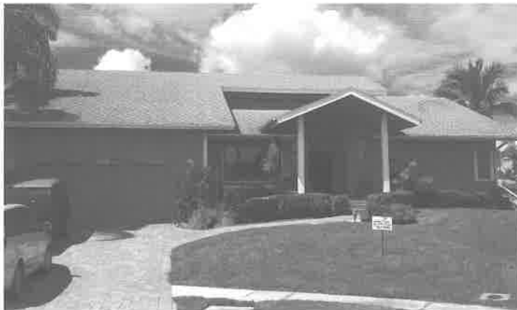
Front View (9/27/2012)

If using the Elevation Certificate to obtain NFIP flood insurance, affix at least two building photographs below according to the instructions for Item A6. Identify all photographs with: date taken; "Front View" and "Rear View"; and, if required, "Right Side View" and "Left Side View." If submitting more photographs than will fit on this page, use the Continuation Page, following.