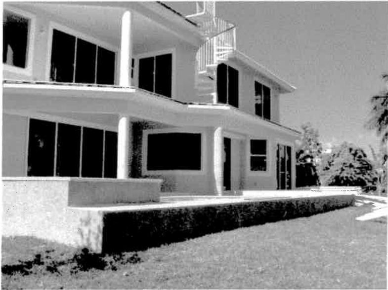
Rear View 12/20/07