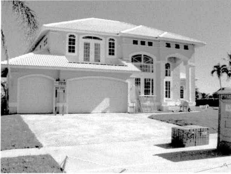
Front View 12/20/07

If using the Elevation Certificate to obtain NFIP flood insurance, affix at least two building photographs below according to the instructions for Item A6. Identify all photographs with: date taken; "Front View" and "Rear View"; and, if required, "Right Side View" and "Left Side View." If submitting more photographs than will fit on this page, use the Continuation Page, following.