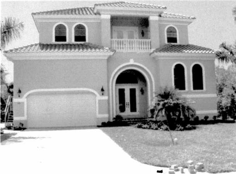
Front View 4/8/2011

If using the Elevation Certificate to obtain NFIP flood insurance, affix at least two building photographs below according to the instructions for Item A6. Identify all photographs with: date taken; "Front View" and "Rear View"; and, if required, "Right Side View" and "Left Side View." If submitting more photographs than will fit on this page, use the Continuation Page, following.