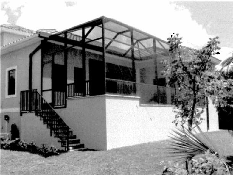
Rear View 4/8/2011